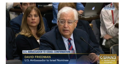
David Friedman, President Donald Trump's pick to serve as the next US envoy to Israel.

FRIEDMAN: Asked about his connections to Beit El, a settlement of religious nationalists near Ramallah in the West Bank, Friedman said his affiliation had been as the president of a group called American Friends of Beit El Yeshiva, the U.S. fundraising arm of the settlement's Jewish seminary and affiliated institutions. He said the money he'd helped raise had gone toward educational facilities like dormitories, gymnasiums and classrooms.