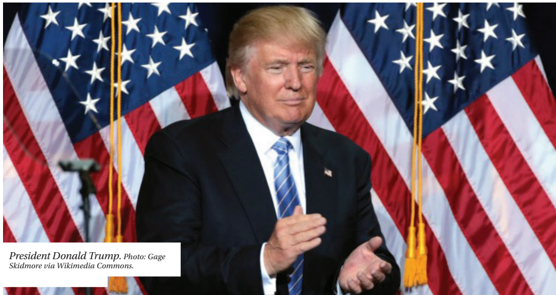
President Donald Trump.