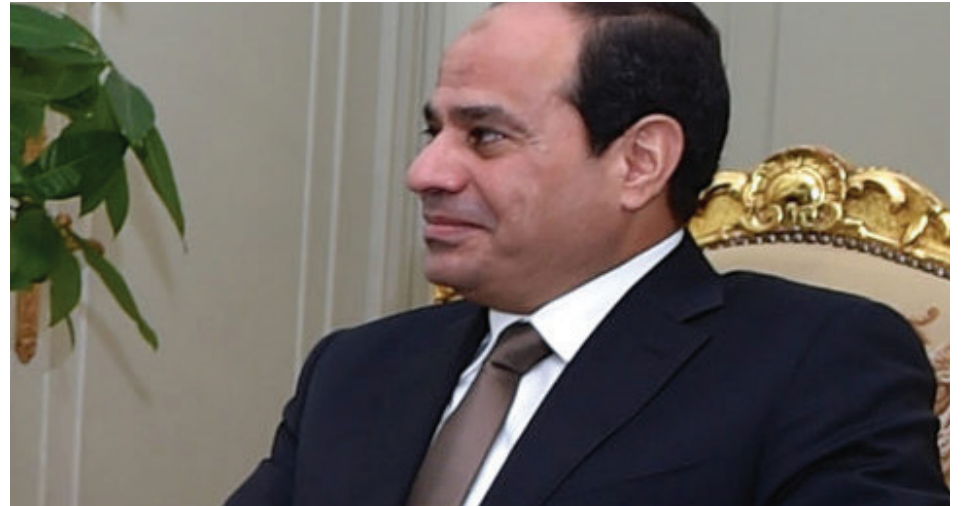
Egyptian President Abdel Fattah el-Sisi.