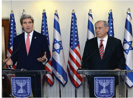
Former US Secretary of State John Kerry (left) and Israeli Prime Minister Benjamin Netanyahu.

When the subject was raised Sunday at a Likud party ministers' meeting, Netanyahu