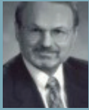
MORTON A. KLEIN NEW YORK

It was exhilarating to watch US President Donald Trump, at his press conference with Israeli Prime Minister Benjamin Netanyahu, refuse to parrot the tired, irrational, dangerous mantra that a Palestinian state is the only option for peace.