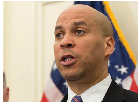
Democratic Senator Cory Booker of New Jersey.

Anti-Israel organizations have mounted a campaign to derail Friedman's nomination because of his belief that Jews have the right to live anywhere in their homeland, and that Jerusalem, Israel's eternal capital, should be