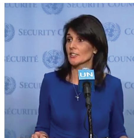
US Ambassador to the UN Nikki Haley.