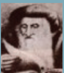
ELDER OF ZION NEW YORK

The AP is attempting to smear David Friedman with this incredibly biased "fact check" article: