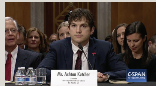
Ashton Kutcher at the Senate.

Kutcher— who was at the session as the co-founder of the initiative “Thorn: Tech Innovation