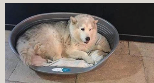
The Netanyahu family dog, Kaia.

Upon Kaia’s release, the prime minister wrote on Facebook about the treatment she had received, which, he said, left much to be desired. He added that he intended to take the matter up with officials in the ministries of health and agriculture, as well as with animal rights groups, to come up with proposals for improving the existing laws.