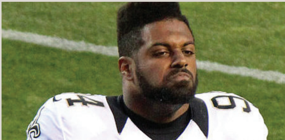
Cameron Jordan.