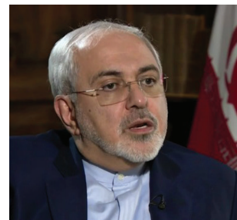
Iranian Foreign Minister Mohammad Javad Zarif.

putting Iran on notice" over recent hostile behavior, including a ballistic missile test.