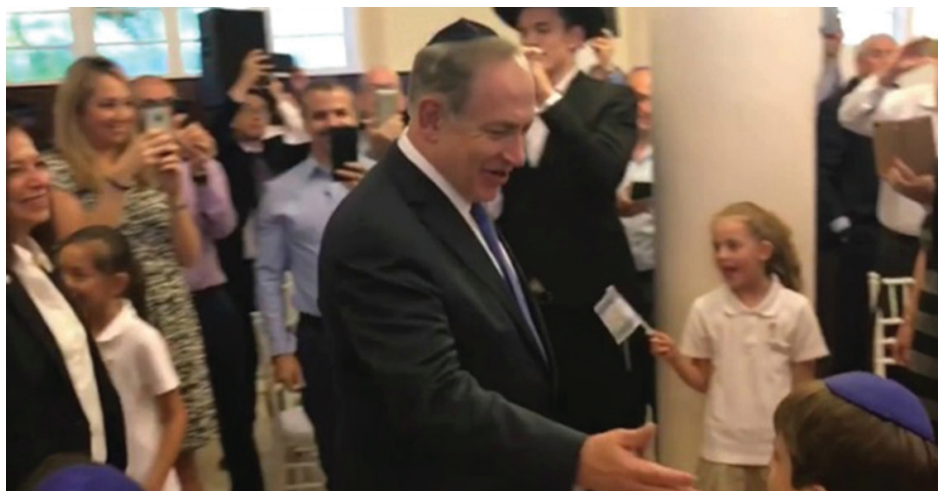
Israeli Prime Minister Benjamin Netanyahu enters the Maghain Aboth Synagogue in Singapore on Monday.