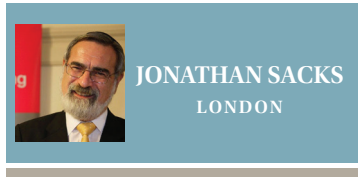
JONATHAN SACKS LONDON

First in Yitro there were the Aseret Hadibrot, the "ten utterances" or general principles. Now in Mishpatim come the details. Here is how they begin: