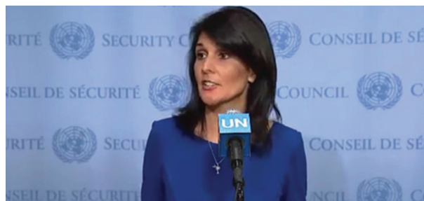
US Ambassador to the UN Nikki Haley.

After meeting with Danon for the first time earlier this month, Haley said, "Never again will our allies have to question our support."