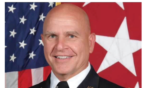
Lt. Gen. H.R. McMaster.

It was around this time that The United States entered the war after the Japanese attack on Pearl Harbor on December 7, 1941. America mobilized. The war involved all of