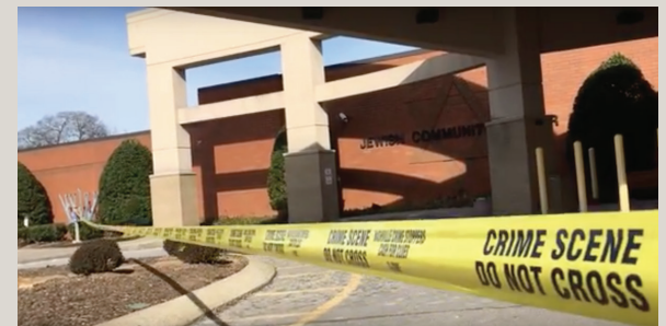
Police tape outside the JCC in Nashville, Tenn., after a recent telephone bomb threat.

In a statement on Monday, Anti-Defamation League CEO Jonathan A. Greenblatt said, "We are confident that