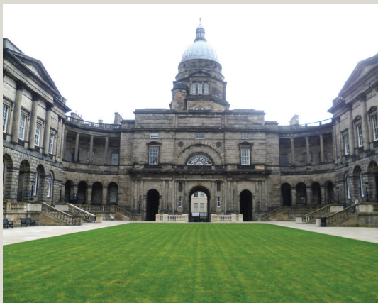
University of Edinburgh.

More than 100 students and community members are expected to attend the scroll dedication ceremony next month, which will take place at a venue on campus and include an LED show from DeLighters, a physical performance troupe.