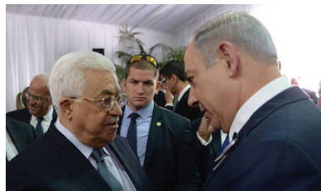
Palestinian Authority President Mahmoud Abbas and Israeli Prime Minister Benjamin Netanyahu.

a minimum, must maintain control over the major Jewish communities in Judea-Samaria, and, as Netanyahu said during Wednesday's joint press conference, Israel needs "overriding security control over the entire area west of the Jordan River," because "otherwise we'll get another radical Islamic terrorist state in the Palestinian areas exploding the