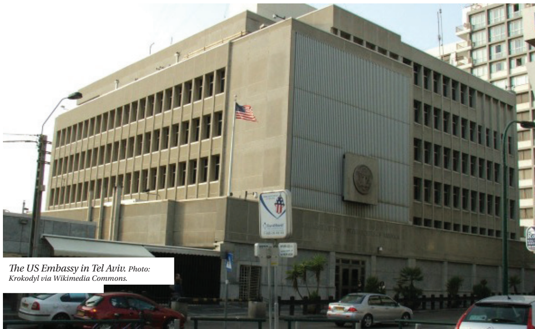
The US Embassy in Tel Aviv.