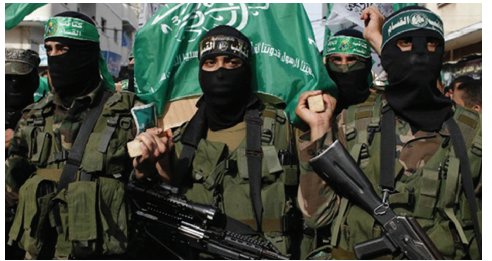
Hamas fighters.