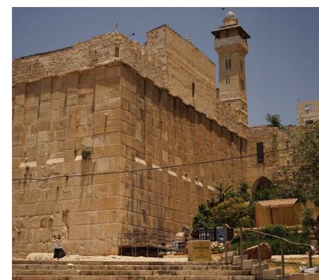
Tomb of the Patriarchs in Hebron, Israel.

Israeli occupation and oppression in Hebron are no less compelling to The New York Times . Two Jewish novelists — husband and wife Michael Chabon and Ayelet Waldman — ventured from their home in Berkeley to Hebron, where “cruel absurdities” are more “intense” than anywhere else in Israel’s “occupied territories” (otherwise