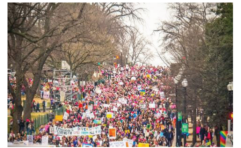
A scene from the Women's March protests against Donald Trump.

His commitment to recognizing Jerusalem as the capital of Israel would have more than symbolic value. It would have a