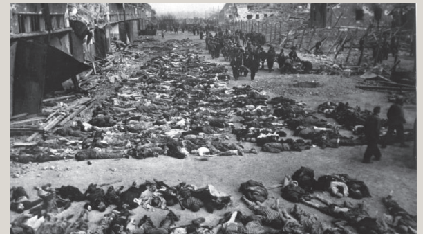
Rows of bodies of dead inmates fill the yard of Lager Nordhausen, a Gestapo concentration camp.