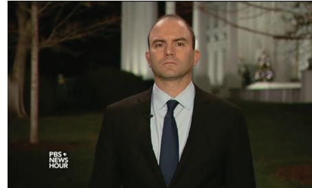
Former Deputy US National Security Adviser for Strategic Communications Ben Rhodes.

"We created an echo chamber," he told the Times, when asked to explain how he organized experts to endorse the deal. "They