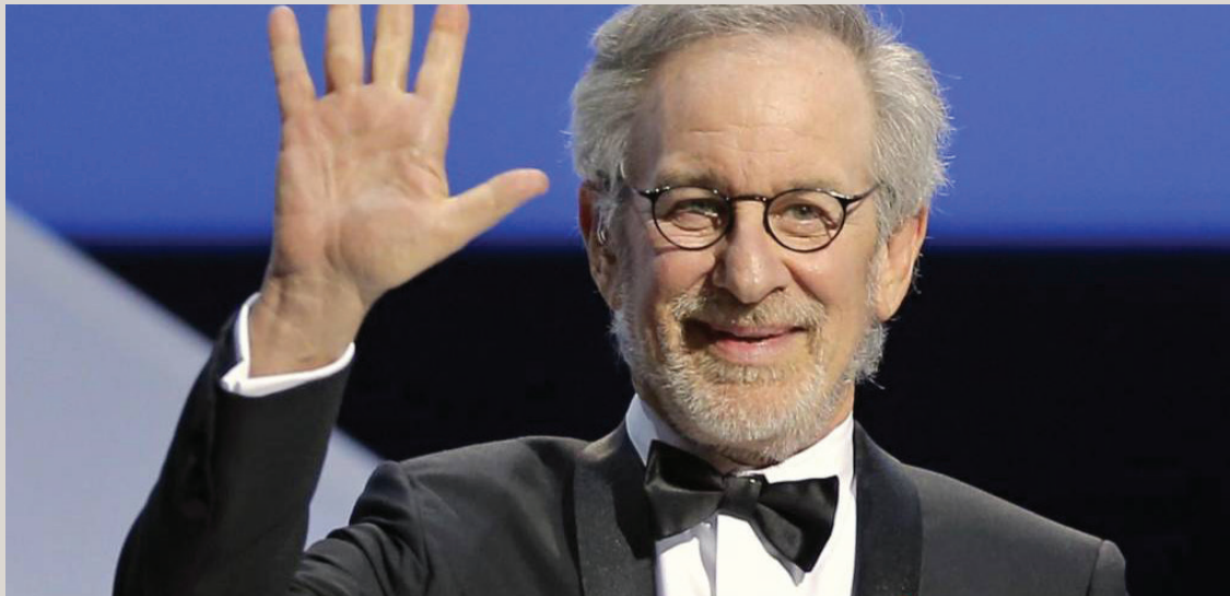
Steven Spielberg.