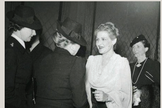
Magda Goebbels.

In late April 1945, the Soviet Red Army entered Berlin, and the Goebbels family moved