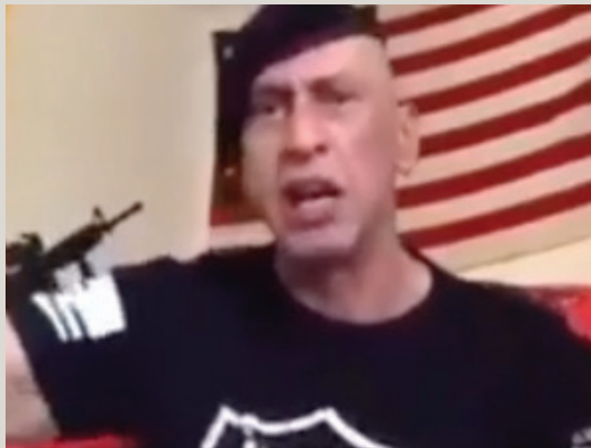
An Iraqi Muslim praising Israel and the Jews in a video clip.

An Iraqi Muslim who said he fled his country due to its volatile security situation professed his love for