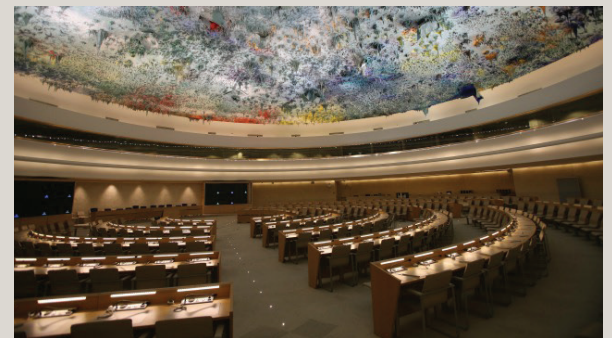
The meeting room at the UN Human Rights Council headquarters in Geneva, Switzerland.

“While we are making some progress on reversing the