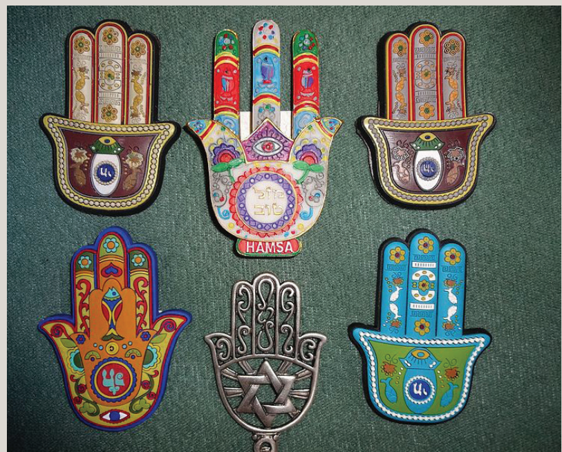
Collection of Jewish amulets, or hamsas.

Know, my masters, that it is not proper for a man to accept as trustworthy anything other than one of these three things. The first is a thing for which there is a clear proof deriving from man's reasoning — such as arithmetic, geometry, and astronomy. The second is a thing that a man perceives through one of the five senses — such as when he knows with certainty that this is red and this is black and the like through the sight of his eye; or as when he tastes that this is bitter and this