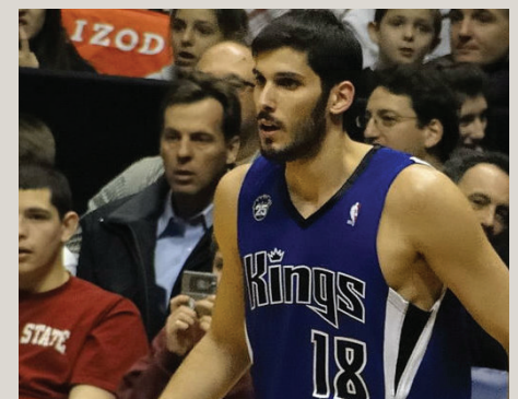
Omri Casspi.