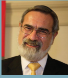
JONATHAN SACKS LONDON, UK

Right at the end of the book of Shemot, there is a textual difficulty so slight that it is easy to miss, yet – as interpreted by Rashi – it contains one of the great clues as to the nature of Jewish identity: it is a moving testimony to the unique challenge of being a Jew.