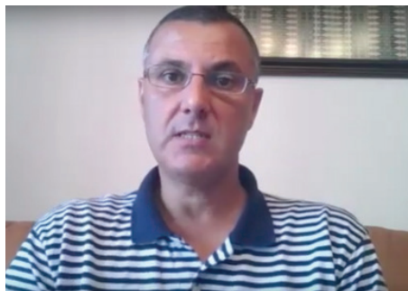
Omar Barghouti.

Following an interrogation by authorities in Haifa, Barghouti was released on bail, but is subject to a travel ban and cannot leave the country.