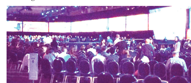
The opening session at AIPAC's annual policy conference in 2016.

While he was a presidential candidate, Trump spoke at last year's policy conference, igniting a controversy when he said "yay" about how it was President Barack Obama's final year in office. Following the AIPAC crowd's significant applause for Trump's remark about the sitting president, the lobby distanced itself from the candidate's rhetoric the next day, acknowledging on the convention stage that "there are people in our AIPAC family who were deeply hurt last night" and lamenting that "so many applauded a sentiment that we neither agree with nor condone."