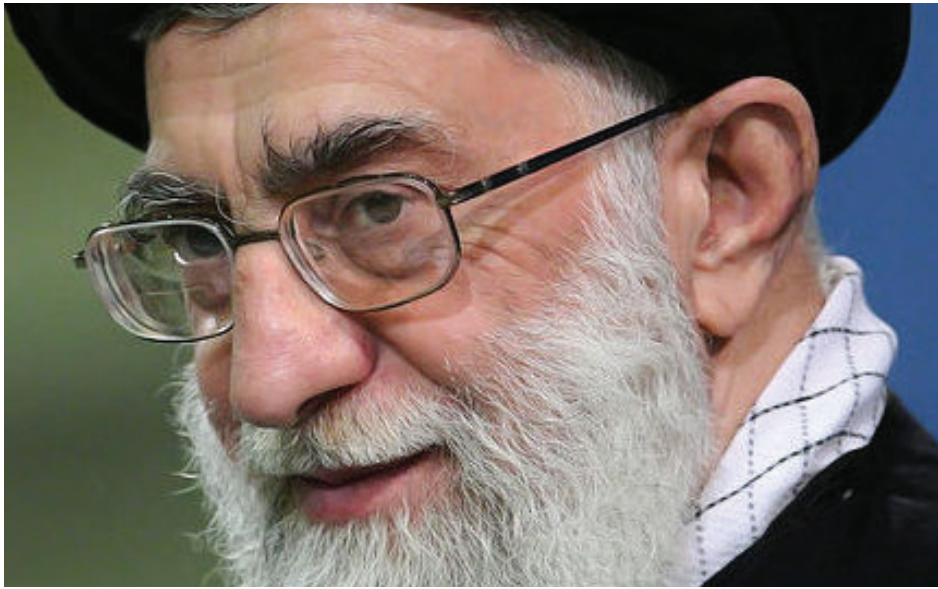
Iranian Supreme Leader Ali Khamenei.