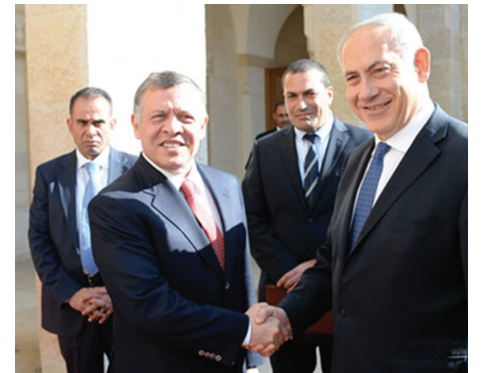
Israeli Prime Minister Benjamin Netanyahu with Jordan's King Abdullah II in Amman, Jordan, Jan. 16, 2014.