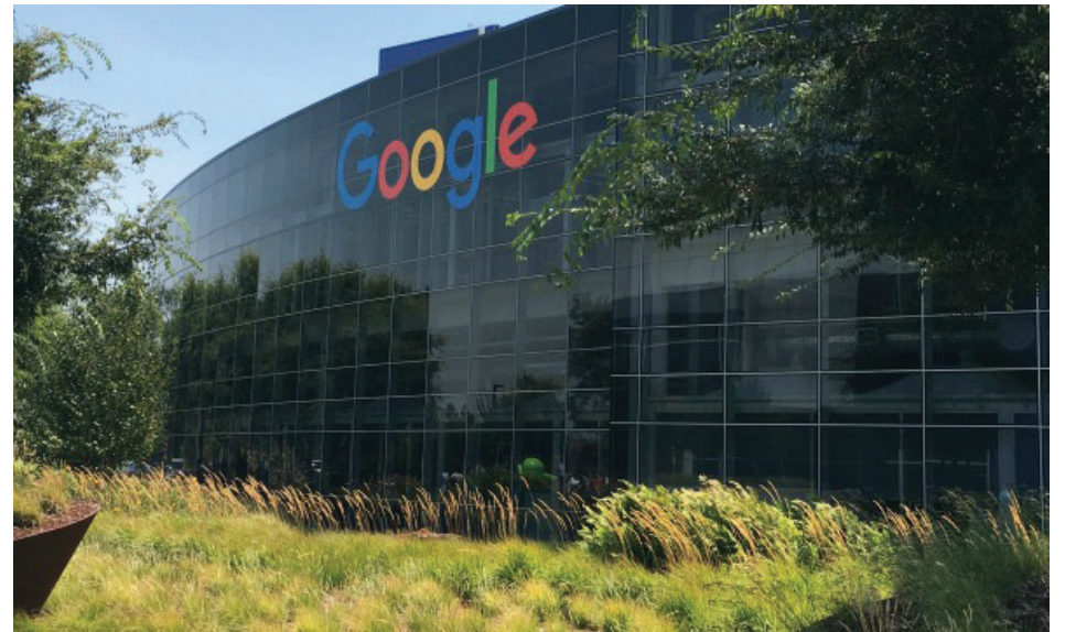
Google headquarters in Mountain View, California.