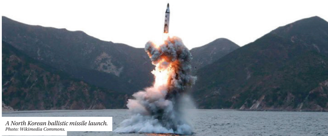
A North Korean ballistic missile launch.