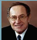
ALAN DERSHOWITZ BOSTON

On March 8, women abstained from work as part of the International Women's Strike (IWS), a grassroots feminist movement aimed at bringing attention "to the current social, legal, political, moral and verbal violence experienced by contemporary women at various latitudes." But these positive goals were distorted by the inclusion of anti-Israel rhetoric in the IWS platform.