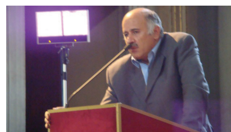
Jibril Rajoub.

terrorist activity and was detained on several occasions. In between and following his bouts in jail, Rajoub continued to work with terrorist cells in the West Bank, and was arrested for his part in the First Intifada. In 1988, he was deported to Lebanon, from where he moved to Tunisia, serving as an "intifada adviser" to PLO chief Yasser Arafat's deputy, Khalil al-Wazir, and subsequently — after Wazir's assassination by Israeli commandos — as a close aide to Arafat himself.