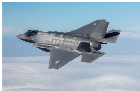
An Israeli Air Force jet.

Al-Jaafari's comments came after last week's meeting between Putin and Israeli Prime Minister Benjamin Netanyahu in Moscow, which was convened to "prevent friction" in Syria.