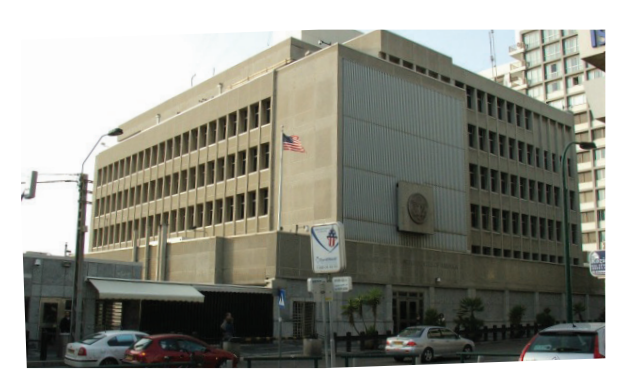
The US Embassy in Tel Aviv.

The effort to move the embassy was once a mainstream Jewish obsession and resulted in numerous Democratic and Republican