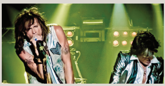
Aerosmith performs in the Netherlands in June 2010.

Aerosmith's performance in Israel is the first installment of its farewell "Aero-Vederci Baby!" tour — marking 40 years of the group performing together — and is the second time the legendary Bostonian rock band has