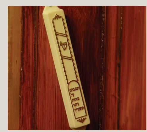
A mezuzah.

The landlord evicted the two in April, but they ignored the order to leave the building, according to the Post report.