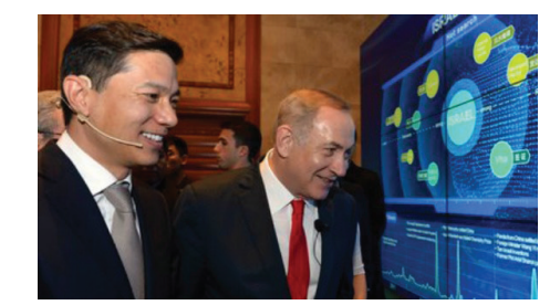
Israeli Prime Minister Benjamin Netanyahu (center) with Chinese internet entrepreneur Robin Li (left) in Beijing, March 21, 2017.

branch of the state-owned China Everbright Group, is also seeking to invest in Israel's "start-up nation."