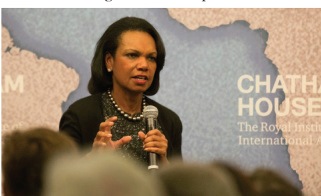
Former US Secretary of State Condoleezza Rice.

Rice also offered a stalwart defense of the 2003 US invasion of Iraq. "I would rather be Iraqi than Syrian today," she said. "You can posit that it was better for the Iraqis to continue under a dictator who was putting 300,000 people in mass graves if you want to make that case. I don't want to make that case and when people say, 'Well, Iraq is such a disaster,' I want them to explain to me why they think that under Saddam Hussein it was a bucolic, benign dictatorship."