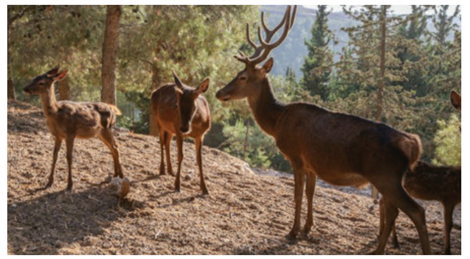
Deer at the Eretz Ayalim park in the West Bank.