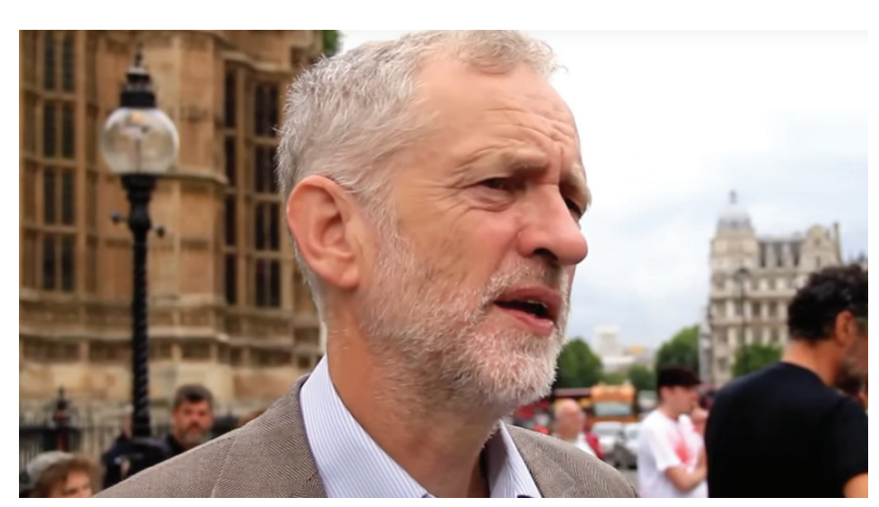
Labour Party leader Jeremy Corbyn.