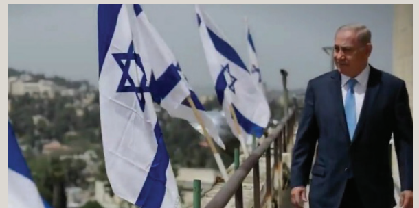
Israeli Prime Minister Benjamin Netanyahu. Photo: Screenshot.

"It was a moment of triumph for our people," Netanyahu said. "We had been scattered around the world for millennia. And then we returned to our ancient homeland, to build a safe haven, where we could live, and thrive."