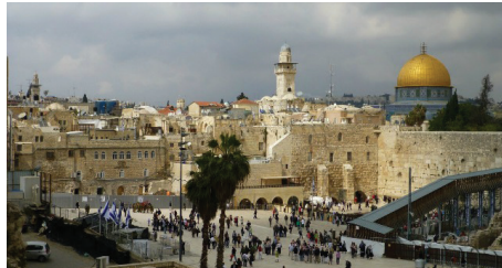
The Western Wall and Temple Mount