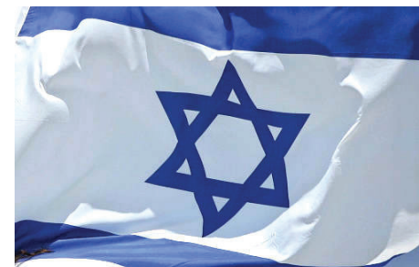
The Israeli flag.

Antisemitism is at an all-time high with Jews in most European countries treated like