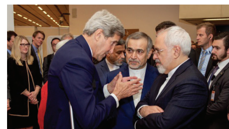
Former US Secretary of State John Kerry speaking with Iranian Foreign Minister Mohammad Javad Zarif in Vienna, Austria, July 2015.

But those who assumed the Trump administration would give up and deem the problem insoluble may be wrong. Contrary to his critics' assumptions, Trump does not need to tear up the deal to attempt to undo its consequences. The pact gave broad leeway to its signatories to interpret its terms. This means Trump can police Iran far more strictly than Obama did. By tightening restrictions on terror groups — such as Iran's Islamic Revolutionary Guard Corps (IRGC), which has a hand in much of the country's economic activity — the US can start to recreate the leverage over the ayatollahs that Obama