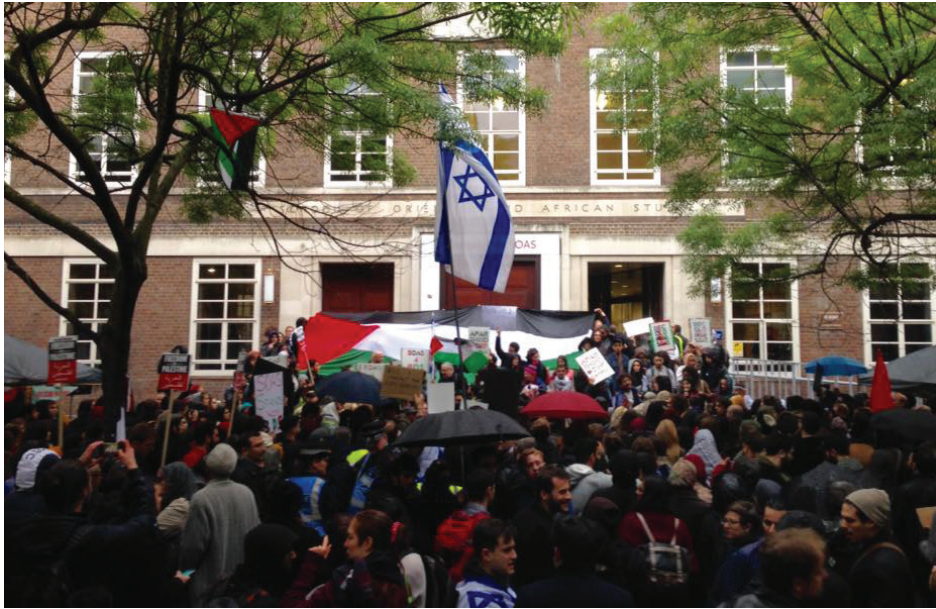
Demonstrators at the School of Oriental and African Studies in London on Thursday.