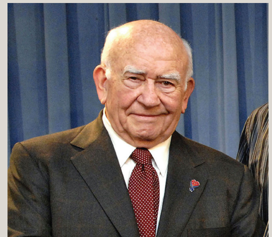
Ed Asner.

You have said that you "just want peace." So do the Israelis, who have endured almost seven decades