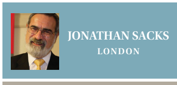
JONATHAN SACKS LONDON

The nineteenth chapter of Vayikra, with which our parsha begins, is one of the supreme statements of the ethics of the Torah. It's about the right, the good and the holy, and it contains some of Judaism's greatest moral commands: "You shall love your neighbour as yourself," and "Let the stranger who lives among you be like your native-born. Love him as yourself, for you were strangers in Egypt."