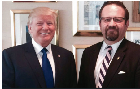
Sebastian Gorka with US President Donald Trump.

Like it or not, to understand the conflict around Gorka, you need to understand Horthy