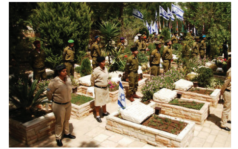
Graves of fallen IDF soldiers at the Mount Herzl military cemetery in Jerusalem.

But for God's sake, what is the world's problem with the Jews that our young people have to dedicate three years of their lives in the prime of their youth to mandatory military