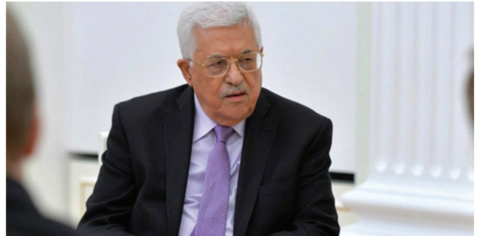
Palestinian Authority President Mahmoud Abbas.