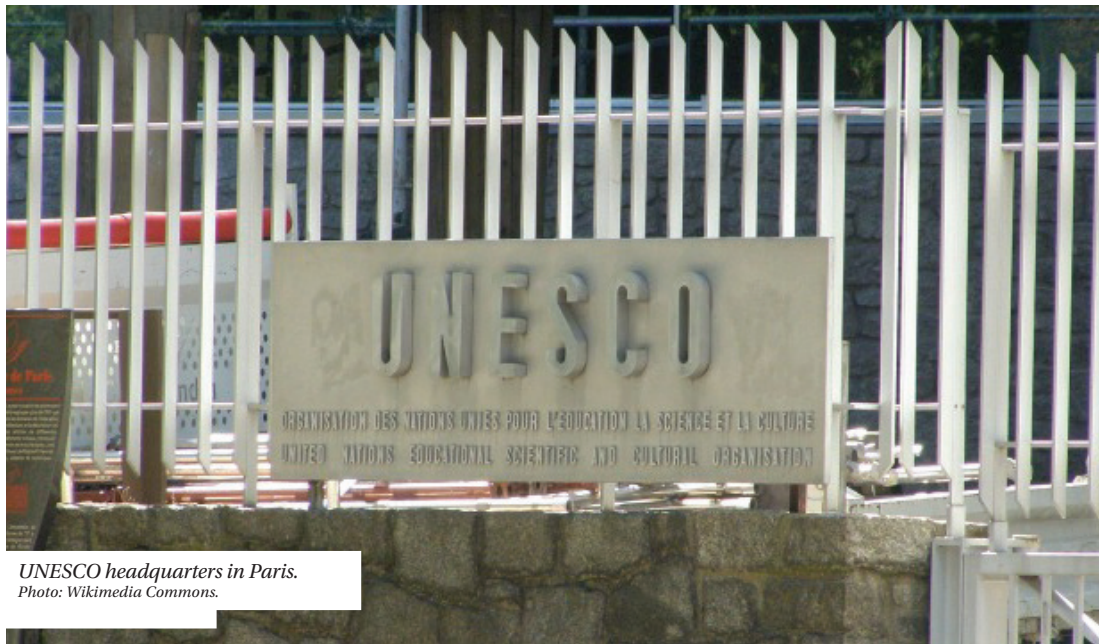
UNESCO headquarters in Paris.