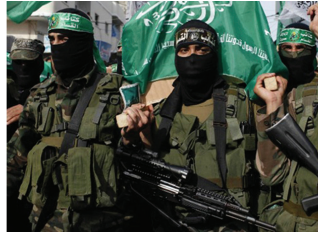
Hamas fighters.

Even discounting for the "man bites dog" phenomenon, though, the Times wildly overplays the "Hamas moderates" story while