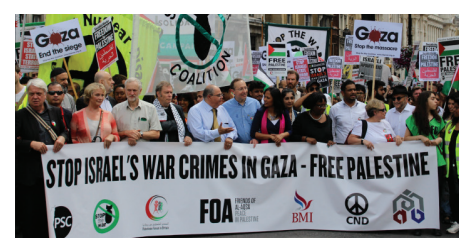
Jeremy Corbyn (fourth from left), leader of the UK Labour Party, carries a “Friends of Al-Aqsa” banner at a past demonstration in London.

On Monday, Friends of Al-Aqsa responded to the government’s threat of cancellation by publishing the message “The Show Will Go Ahead” on its website.