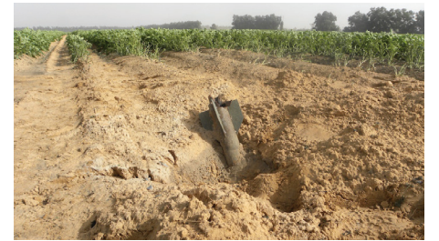
The remnants of a past Gaza rocket fired into southern Israel.

"Since the terror organization Hamas is the ruler of the Gaza Strip, it is responsible for