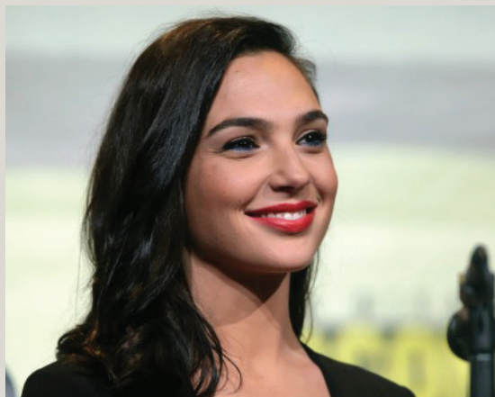
Israeli actress Gal Gadot.

Gadot's "Wonder Woman" film has topped $570 million in global earnings after debuting in early June, despite BDS campaigns to boycott the movie in Lebanon, Jordan, Tunisia and Algeria due to the Israeli actress' leading role.