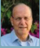
YORAM ETTINGER TEL AVIV

In recent weeks, commentators and others have been worried about the prospect of US pressure being applied to Israel. Can Israel afford, they ask, to defy US presidential pressure to concede land — land that is historically and militarily critical to the future of the Jewish state?