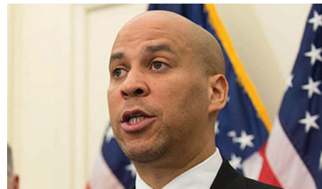
Democratic Senator Cory Booker of New Jersey.

According to some estimates, Iran is providing the Assad regime with up to $20