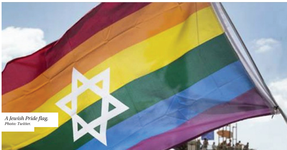
A Jewish Pride flag.