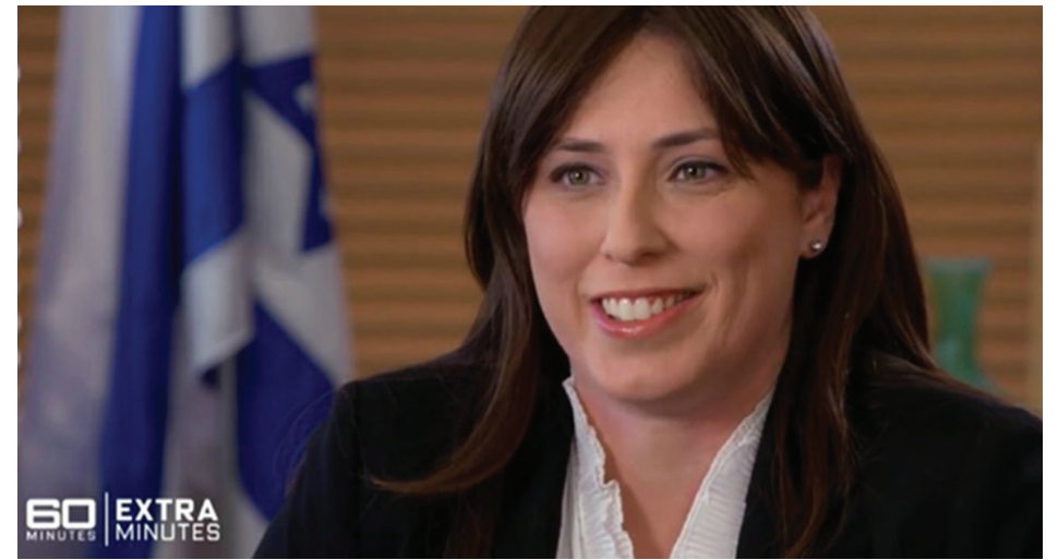
Israeli Deputy Foreign Minister Tzipi Hotovely. Photo: Screenshot.