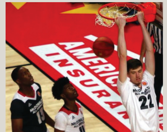
The Indiana Pacers chose Israeli-born player T.J. Leaf (right) with the 18th pick in the 2017 NBA draft.

Leaf averaged 16.3 points and 8.2 rebounds per game in his only season for University of California, Los Angeles (UCLA). The Pacers drafted him with the 18th pick. In 2009, the Sacramento Kings used the 23rd pick on small forward Omri Casspi, who