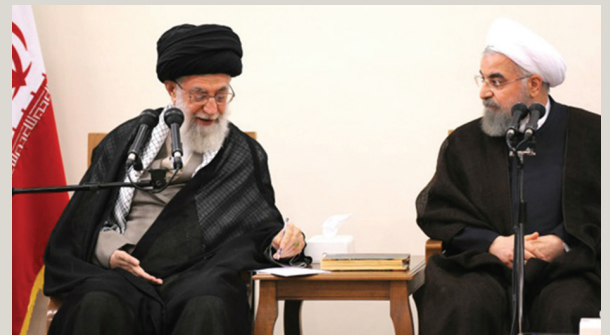
Iranian Supreme Leader Ayatollah Khamenei (left) and President Hasan Rouhani.

Just four days after Iranian President Hasan Rouhani's Al-Quds Day message urging Muslims to direct "hatred towards the occupying and usurping regime (Israel)," the