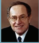
ALAN DERSHOWITZ BOSTON

This article previously appeared in Fox News.