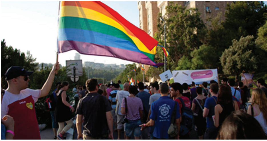
A past Pride Parade in Jerusalem (illustrative).