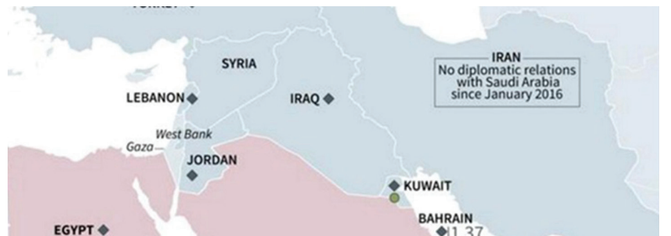
An AFP map of the Middle East published earlier this month that excluded Israel.

Commenting on Sunday on Leridon’s letter, Samuels said, “Hardly an amicable apology, but an apology nevertheless. They could have simply thanked the Wiesenthal Center for its letter. Bottom line: Israel is back on the AFP map, until the next time. We shall be monitoring.”