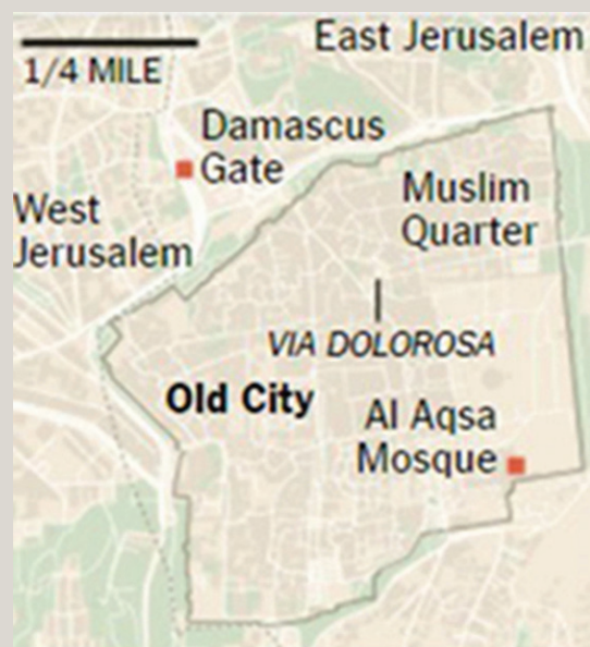
One of the maps that appeared in the New York Times.

One map features a red square labeled “Damascus Gate” floating what appears to be nearly an eighth of a mile away from the walls of the Old City of Jerusalem. It makes it appear, inaccurately, as if the “gate” is a freestanding attraction rather than an entrance to the Old City.