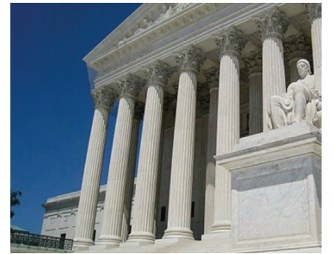
The US Supreme Court building in Washington, DC.

So the travel ban will now go into effect with regard to non-American persons. It is impossible to know whether this will have any positive effect on reducing terrorist attacks in the US. But under our law, the president has no burden to prove that he is right as a matter of policy — only that he had the authority to