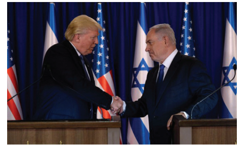
US President Donald Trump and Israeli PM Benjamin Netanyahu at a May 2017 press appearance in Jerusalem.

Ignoring Middle East reality, US pressure on Israel has focused on the Palestinian issue, which has never been the crux of the Arab-Israeli conflict, a core cause of regional turbulence and anti-US Islamic terrorism, or a crown-jewel of Arab policy-making.