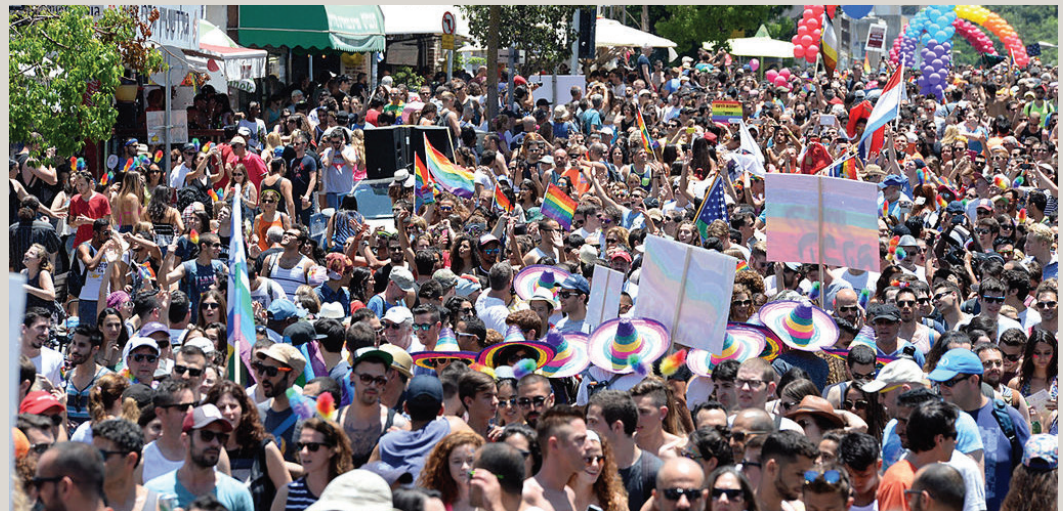
A Tel Aviv gay pride parade.

Furthermore, sexual assault and harassment, domestic violence and honor killings still remain a problem in Palestinian society. In 2014, the Washington Post, along with multiple other outlets, reported that “honor killings” of women had doubled in the Palestinian territories from 2012