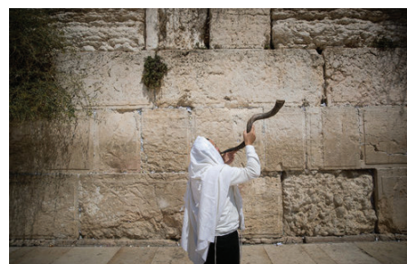
A haredi Jew blows a shofar at the Western Wall in Jerusalem's Old City, Aug. 28.

This reflects the triumph of freedom in the U.S. in which rising rates of assimilation are a function of the collapse of the barriers between faiths. But the idea that a growing demographic in which Jewish traditions, law and faith is absent can sustain support for Israel is risible. While it can be argued that a secular Jewish identity can be sustained in