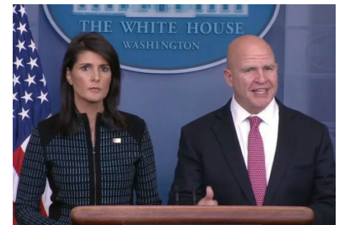
US Ambassador to UN Nikki Haley and National Security Adviser H.R. McMaster speak at the White House on Friday.

down with Palestinian Authority President Mahmoud Abbas. Trump has, on several occasions, expressed a desire to broker an Israeli-Palestinian peace agreement, which he has called the "ultimate deal."