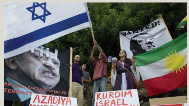
Israelis of Kurdish origin demonstrating at the Turkish Embassy in Tel Aviv in 2010.

As the impending referendum on independence for the Kurdish region of Iraq draws closer, pro-government media outlets in Turkey – which remains bitterly opposed to Kurdish self-determination – are energetically promoting conspiracy theories centered on the alleged relations between Kurdish leader Masoud Barzani and the Israeli authorities.