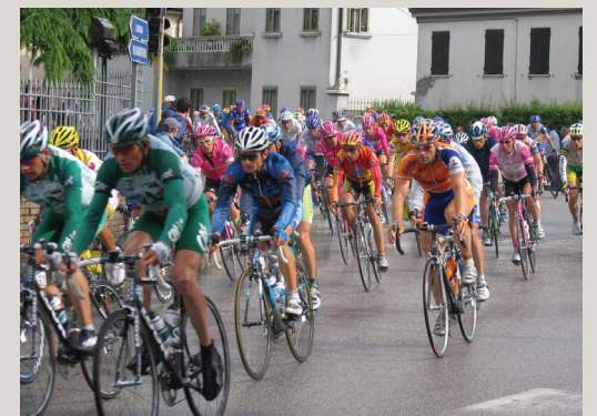
The Giro d'Italia is one of the cycling world's top events that will be coming to Israel in 2018.

More than 175 of the world's top cyclists are expected to arrive in Israel for the event, which is likely to be the biggest sporting event ever held in