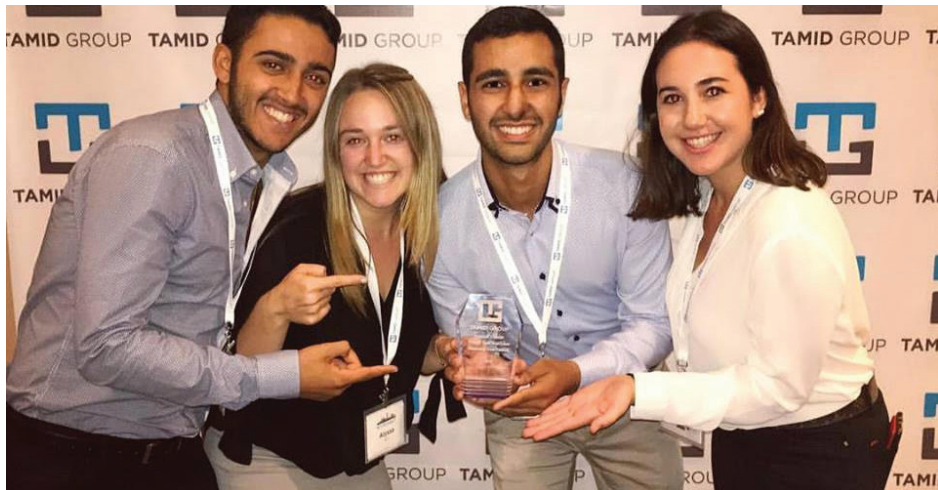
Students at the TAMIDcon 2017 held in Washington, D.C. in early September.