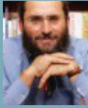
SHMULEY BOTEACH ENGELWOOD

Before the Sabbath, I participated in President Trump's conference call with Jewish leaders for the new year. The invitation said that the President would "send well wishes for the upcoming holidays" and then move on to "discuss his administration's progress on issues of interest to the Jewish community."