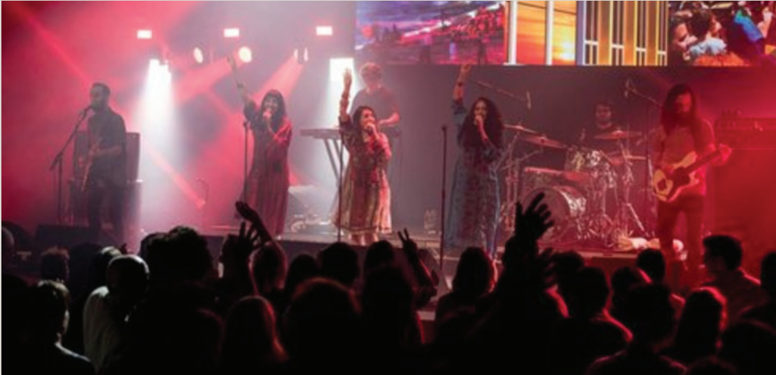
Performers at the "Women in Power" concert during the TLVinLDN event in London.