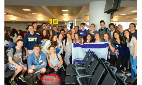
Muhlenberg College students leaving for a Birthright Israel trip.

JVP wants American-Jewish youth to boycott a way of learning about their heritage. Instead, the group is encouraging these college kids to go on any one of 47 "alternative tours" to Israel and the West Bank. These trips include tours with outfits with innocuous sounding names, such as the International