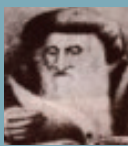
ELDER OF ZIYON NEW YORK

another version for the rest of the world.