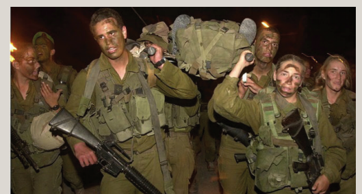
IDF soldiers during basic training.

A delegation from the Giro d'Italia is currently in Israel finalizing locations for the opening stages. Organizers are expected to announce the precise route next week at a ceremony attended by Italian and Israeli officials along with retired Spanish cyclist and two-time Giro winner Alberto Contador.