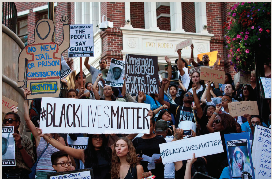
Black Lives Matter protesters in Beverly Hills, California.

When students with inquisitive minds get to college, they should explore and possibly identify with groups that are trying to improve the world and humanity. But on many campuses, students are being forced to choose. You cannot be pro-Israel (warts and all, and who has no warts?) and strive to solve the problems of Muslims or other victims around the world. This cannot make