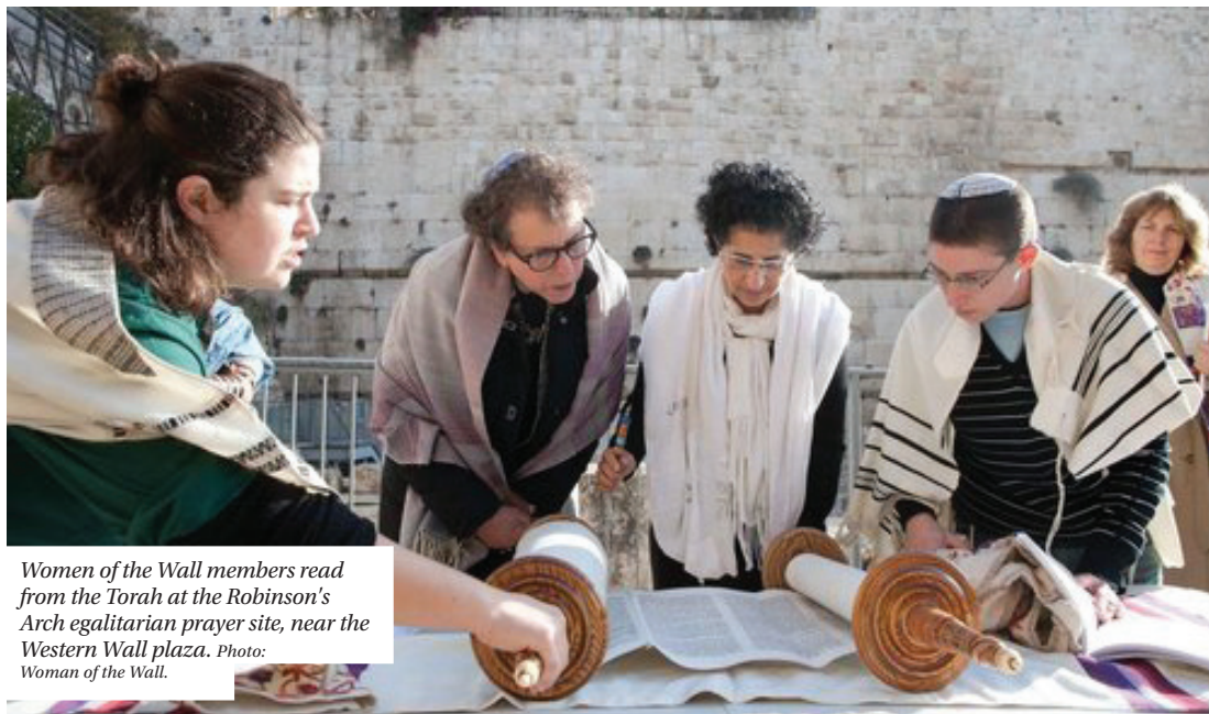
Women of the Wall members read from the Torah at the Robinson's Arch egalitarian prayer site, near the Western Wall plaza.