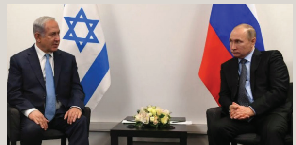
Israeli Prime Minister Benjamin Netanyahu and Russian President Vladimir Putin meet in Moscow on Jan. 29, 2018.

"We also spoke about Lebanon, which is becoming a factory for precision-guided missiles that threaten Israel.