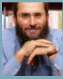
SHMULEY BOTEACH ENGELWOOD

Over the weekend Prof. Alan Dershowitz said that had he known about a recently unearthed 2005 photo of Barack Obama and Louis Farrakhan, "I would not have campaigned for Barack Obama."