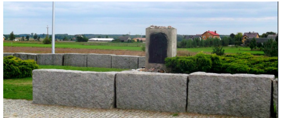
A memorial at the site of the 1941 massacre of Jews in Jedwabne, Poland.

But now all this progress is at risk, triggered, above all, by a new Polish bill