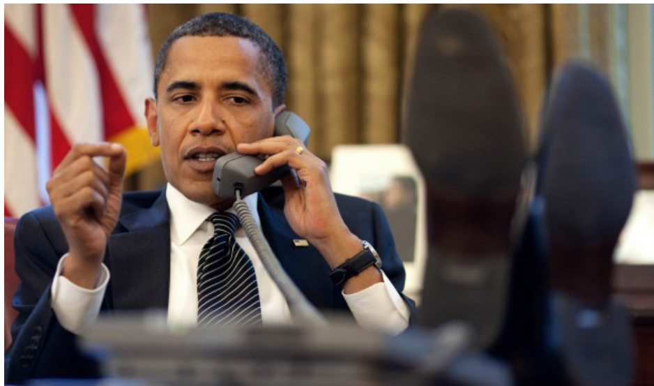
Former US President Barack Obama.