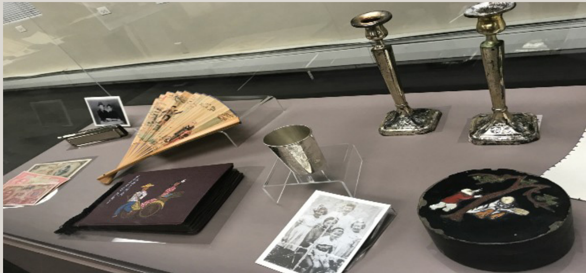
Artifacts showing Jewish life in Shanghai on display on at the Amud Aish Memorial Museum.