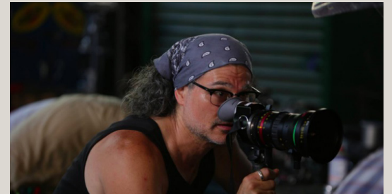
Ziad Doueiri.

The film is about an altercation between a Lebanese Christian and a Palestinian refugee that leads to a heated trial, national attention and discus-