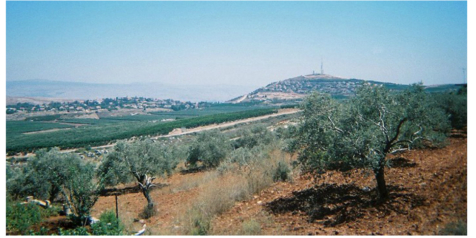
The Israel-Lebanon border area.