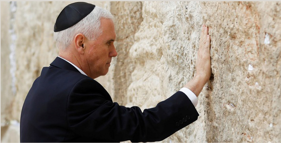
US Vice President Mike Pence touches the Western Wall in Jerusalem's Old City, Jan. 23, 2018.

But there's also a second possible explanation, a more troubling one: that the Times editorial position has worsened over the past two decades, so that it's now more hostile to Israel, or more outspoken about that hostility, than it was 20 years ago. Not much has changed in the warmth of the US-Israel relationship, as the remarkable similarities and consistencies between the Gore and Pence speeches demonstrate. What has changed is the Times . The newspaper is, alas, more hostile than ever to that special relationship, more determined to rip asunder what Gore called eternal ties and what Pence called "an unshakeable bond between our people."