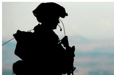
An IDF soldier standing guard at a military base.

Fifteen years ago, during the Second Intifada, the highway experienced many security incidents, particularly firebombing and rock-throwing attacks on cars. That led the Israeli government to ban Palestinians from the