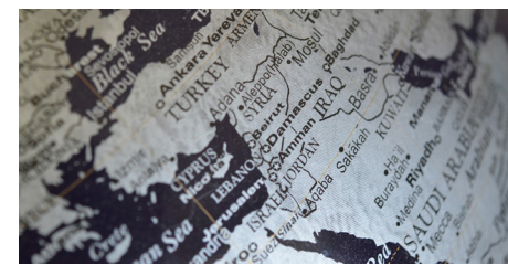
Map of the Middle East.

"They are even willing to threaten federal funding for university-based Middle East