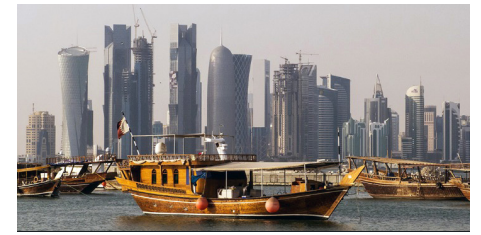
Doha, Qatar.

Joe Biden visited Israel in March 2010. Almost exactly at the moment that Biden was speaking at a press conference with Prime Minister Benjamin Netanyahu, "somebody" leaked to the press that the Israeli government supposedly had just announced plans to build 1,600 Jewish homes in "occupied East Jerusalem."