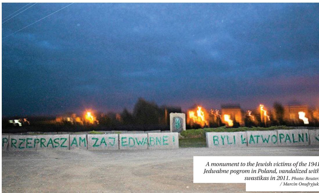
A monument to the Jewish victims of the 1941 Jedwabne pogrom in Poland, vandalized with swastikas in 2011.