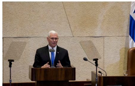
US Vice President Mike Pence addresses the Knesset in Jerusalem, Jan. 22, 2018.

Yes, that was the accusation made by the vice president whose administration had successfully pressured Israel into freezing