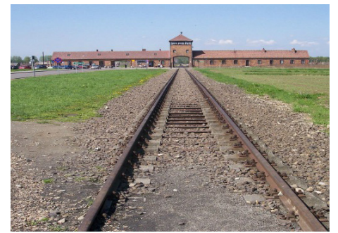
The entrance to Auschwitz-Birkenau.

In this context, it is worth noting that Rouhani's second term in office has been characterized by a change of direction towards the line dictated by the hardliners and the Revolutionary Guards. That shift has been at the expense of the economic welfare of Iranian citizens — and contrary to his proclamations of greater political freedom