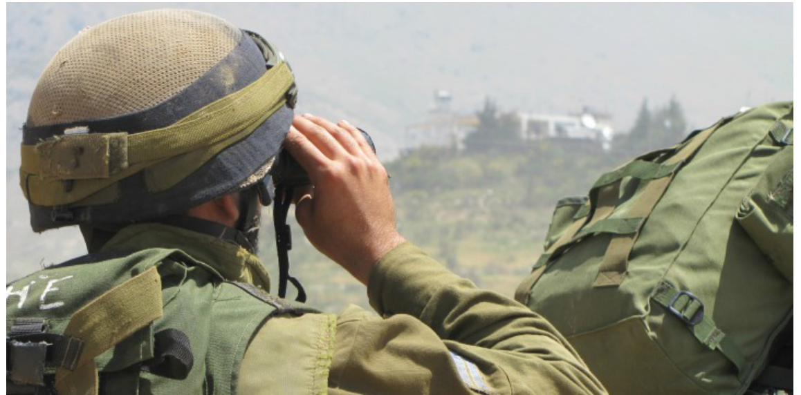
An IDF soldier looks into southern Syria from the Israeli side of the border.

This article was originally published by The American Thinker.