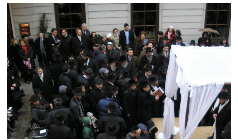
An Orthodox Jewish wedding.

Today, we look to you for inspiration. Those who are in less than loving marriages, or who were hurt by love, want to