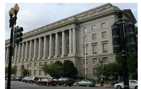
The Internal Revenue Service building in Washington, DC.

"It is thrilling to actually wrestle the IRS to the ground and force it to admit Z Street was targeted because we support Israel and the right of Jews to live everywhere, and that the Obama administration's IRS violated Z Street's constitutional rights by discriminat-