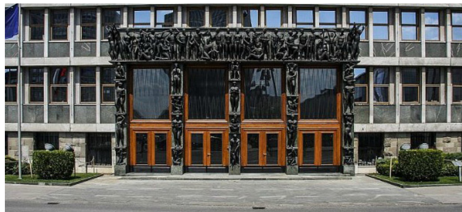
National Assembly of Slovenia.