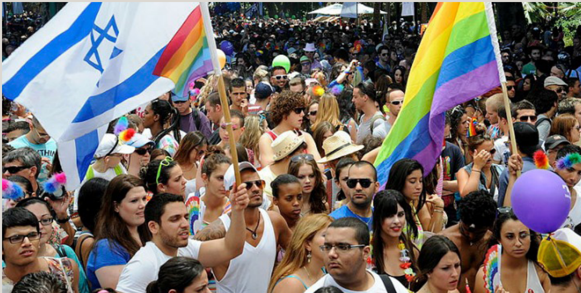
Marchers in a past Tel Aviv Gay Pride Parade.