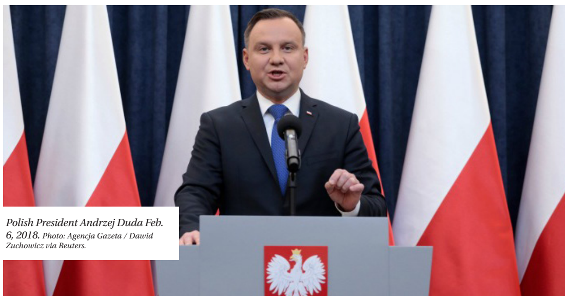
Polish President Andrzej Duda Feb. 6, 2018.