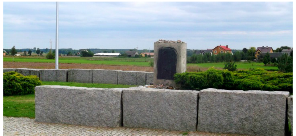
A memorial at the site of the 1941 massacre of Jews in Jedwabne, Poland.

To be sure, some in Israel and the larger Jewish world have made a bad situation worse by pouring oil on the fire, especially in their irresponsible claims suggesting, in effect, that Warsaw — which was attacked mercilessly by German forces on September 1, 1939 — was Berlin's willing partner in