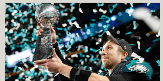
Nick Foles of the Philadelphia Eagles celebrates with the Vince Lombardi Trophy after winning Super Bowl LII.

The Eagles were underdogs throughout the NFL playoffs, and just as most expected little from fictional Philadelphia boxer Rocky Balboa, few onlookers outside the City of Brotherly Love expected them to beat the defending Super Bowl champions.