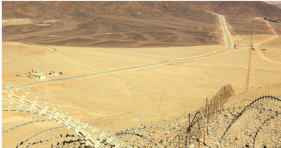
A look into Egypt's Sinai Peninsula from the Israeli side of the border.