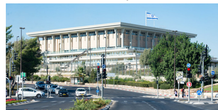
The Israeli Knesset building.

Cue Hazan, who is not introduced to viewers, except for a caption saying "Oren Hazan, Israeli Member of Parliament."