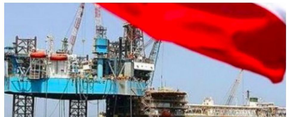
An Iranian oil rig.

Kurdish forces took control of Kirkuk in 2014, when the Iraqi army collapsed in the face of Islamic State. The Kurdish move prevented the militants from seizing the region's oilfields.