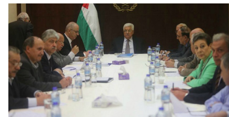
Palestinian Authority President Mahmoud Abbas chairs a meeting of the executive committee of the Palestine Liberation Organization (PLO) in the West Bank city of Ramallah on April 4, 2016.

In a threat to halt ongoing security cooperation between Israel and the Palestinian Authority, the PLO executive committee called on the Palestinian Authority to "define security relations between the Palestinians and the Israeli occupation." Saturday's announcement comes less than