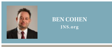
BEN COHEN JNS.org

Who owns the Holocaust? That, ultimately, is the key question posed by the impending legislation in Poland that will criminalize any discussion, or investigation, or mere mention, of incidents of Polish collusion with the Nazi occupiers during World War Two.