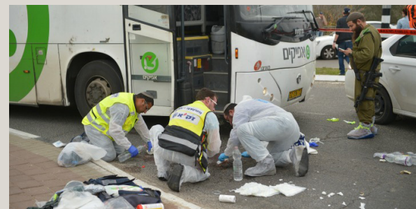
Rescue workers clean the scene following a stabbing attack at an entrance to Ariel, Feb. 5, 2018.