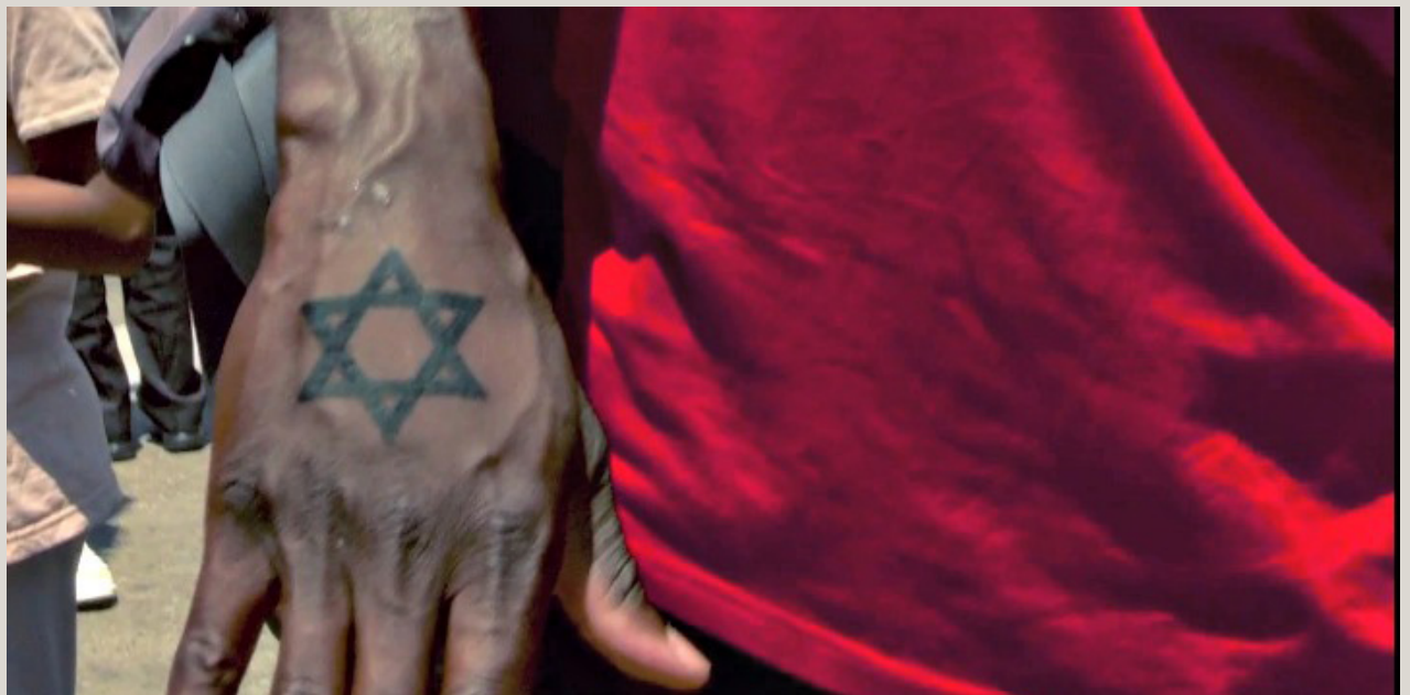
An African migrant in South Tel Aviv. Photo: Courtesy "For You Were Once Strangers" (dir. Ruth Berdah-Canet, 2015.)

It was not something she had expected to do, Berdah-Canet continued, but it became her responsibility as the asylum-seekers lost one option after another in their fight to legally avoid expulsion from Israel. Over the next 60 days, as deportation notices multiply, many other Israelis will likely feel similarly obliged.