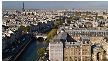
The French capital of Paris.

Habib stressed that "these days, I am worried about France, but not about Israel. I have no doubt that the Zionist enterprise is one of the most moral, ethical endeavors of the 19th and 20th centuries. But if a majority of French people believe that it is a 'global conspiracy,' as the survey found, France is in deep trouble."