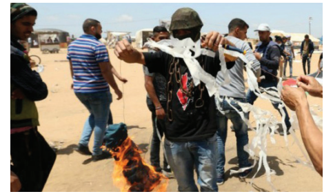
Palestinian rioters in Gaza set a kite on fire to be flown across the border to Israel, May 11, 2018.

Rabbinical sermons have referred to the bulk of those killed as innocents, even though Hamas leaders themselves claim that 85% of them were terrorists. On May 14 at its graduation and ordination ceremony, the Reform movement's Hebrew Union College shamelessly chose as its guest speaker the fiercely