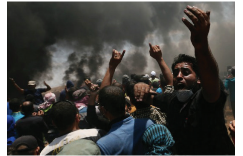
A Palestinian rioter on the Israel-Gaza Strip border, May 14, 2018.

Since its creation as a Muslim Brotherhood spinoff in 1987, Hamas has made its objectives clear. The group’s founding charter calls for the destruction of Israel and the genocide of Jews — even approvingly quoting