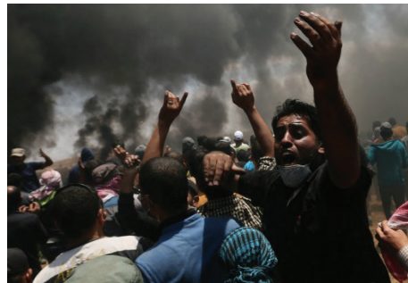
A Palestinian rioter on the Israel-Gaza border, May 14, 2018.

This divide is a major boon to Israel. Violence is much easier to control when it takes place on either the Gaza front or the West Bank front, rather than on both fronts