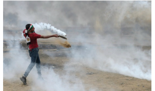
A Palestinian rioter on the Israel-Gaza Strip border, May 4, 2018.

They are not refugees. There is only one definition of refugee under the Refugee Convention. Just because UNRWA calls them refugees does not make them refugees.