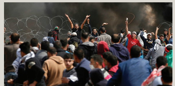
Unrest on the Israel-Gaza Strip border on Friday, April 27, 2018.

"The high percentage of Hamas operatives who were killed during the events of May 14 and in the previous events