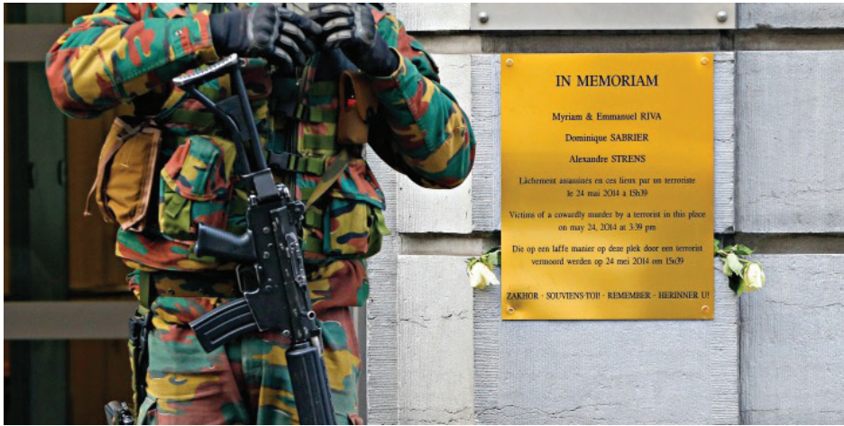
A Belgian soldier stands guard outside the Jewish museum in Brussels, where a plaque commemorates the victims of the 2014 terrorist attack.