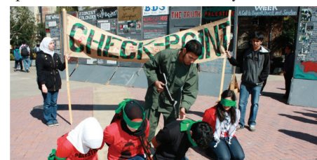
A mock Israeli checkpoint set up during a past “Israeli Apartheid Week” at the University of California, Los Angeles campus.

The necessity of the Anti-Semitism Awareness Act stems from a long legal battle over a spate of incidents at the University of California