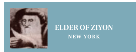
ELDER OF ZIYON NEW YORK