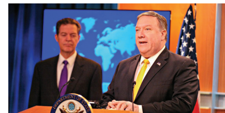
US Secretary of State Mike Pompeo and Amb. Sam Brownback.

Pompeo said he was looking forward "to hosting my counterparts from likeminded governments, as well as representatives of international organizations, religious commu-