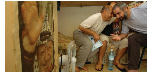
Palestinian political prisoners sit and talk in their cell in the Ayalon complex.

In 2016, the High Court of Justice rejected a petition submitted by Oron Shaul's