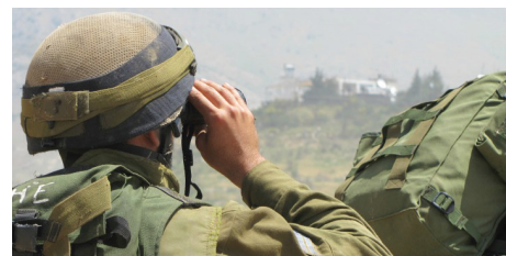
An IDF soldier looks into southern Syria from the Israeli side of the border.

maneuvers involving Iranian-backed forces could trigger a military confrontation between Iran and Israel.