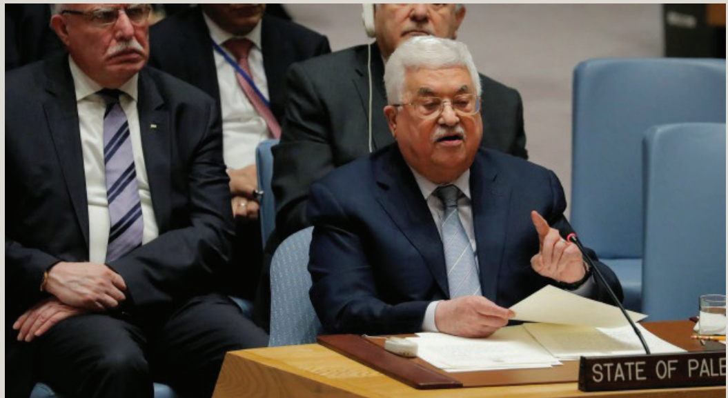
Palestinian Authority President Mahmoud Abbas speaks during a meeting of the Security Council at UN headquarters in New York City, Feb. 20, 2018.

We have excellent relations with our brothers in Hizbullah. Our relations with them are extremely developed. We work together and coordinate and