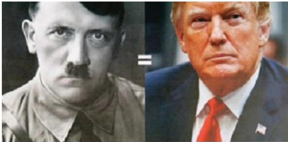
The controversial flyer comparing U.S. President Donald Trump to Nazi leader Adolf Hitler Photo: Israel Hayom.