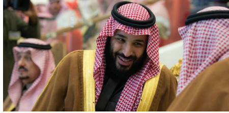
Saudi Arabian Crown Prince Mohammed bin Salman.

Nor is the willingness to give allies a pass for horrible behavior a recent development. The United States embraced the Soviet Union and its genocidal leader, Josef Stalin, during World War II. During the Cold War, a series of Democratic and Republican administrations made nice