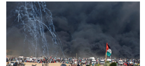
Tear gas canisters are fired by Israeli troops at Palestinian demonstrators during a protest marking al-Quds Day, (Jerusalem Day), at the Israel-Gaza border east of Gaza City June 8, 2018.