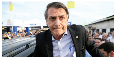
Brazilian presidential candidate Jair Bolsonaro.

Bolsonaro has appealed for the support of Brazil's Jewish community, the second-largest in Latin America, with an uncomplicated embrace of the State of Israel. "My heart is green, yellow, blue and white," Bolsonaro famously told a meeting at a Jewish center in Rio de Janeiro in 2017, in a reference to the colors of the Brazilian and Israeli flags.