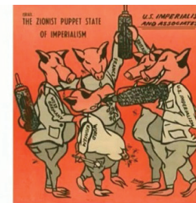
A slide that was part of a presentation at the University of Michigan comparing Prime Minister Benjamin Netanyahu to Hitler.