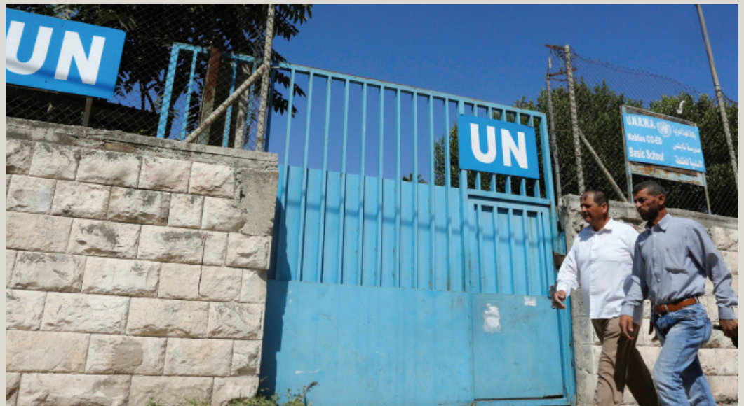
Palestinians pass by the gate of an UNRWA-run school in Nablus in the West Bank, Aug. 13, 2018.