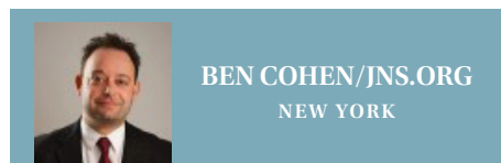
BEN COHEN/JNS.ORG NEW YORK

The world of academia has been riveted by the full account of an elaborate hoax that resulted in several high-profile academic journals publishing articles based on ludicrous notions and fake field research, but couched in the language of social justice and identity politics.