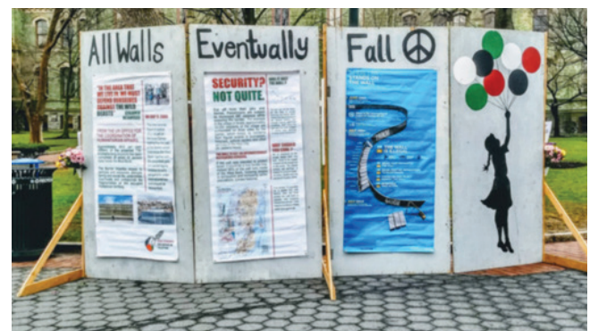
A display erected by Penn Students for Justice in Palestine during its "Israeli Apartheid Week" campaign.

The scientific standards and rationalist principles that underlie the exploration of what constitutes truth are being assailed by what the hoaxers call "the identitarian madness coming out of the academic and activist left." Madness