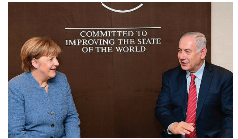
German Chancellor Angela Merkel enjoys a rare light moment with Israeli PM Benjamin Netanyahu at the exclusive Davos annual summit.

Another problem is Merkel's ambivalent policy during the migrant crisis. Vacillating between an "open-door" approach, the need to appease the ire of Bavaria's Christian Social Union, and concern about new terror attacks