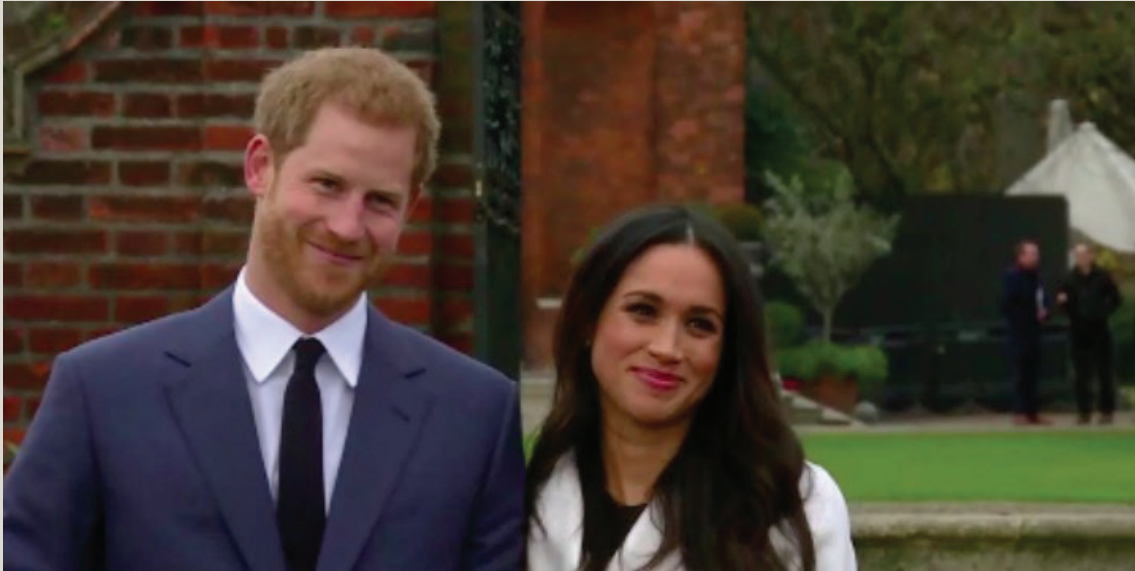
Prince Harry and his fiancée Meghan Markle.