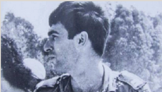
Missing Israeli navigator Ron Arad.

However, in October 2016, a joint investigation by the Mossad intelligence agency and military intelligence, based on new information received in the