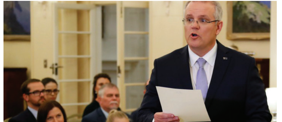
Australian Prime Minister Scott Morrison, Aug. 24, 2018.