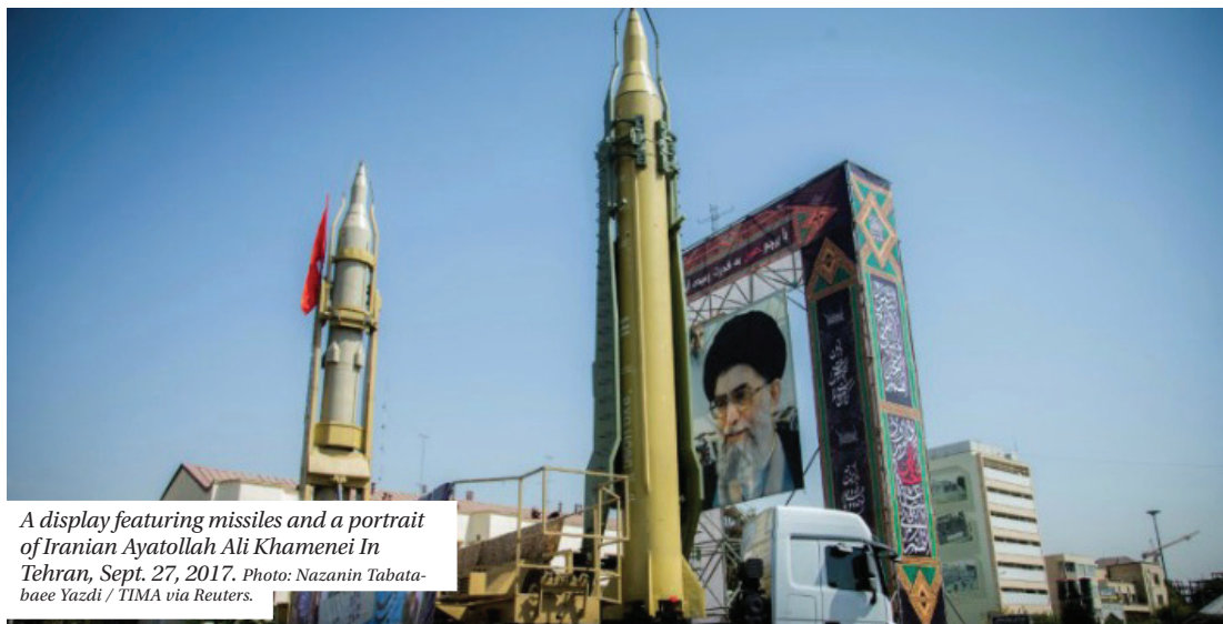
A display featuring missiles and a portrait of Iranian Ayatollah Ali Khamenei in Tehran, Sept. 27, 2017.