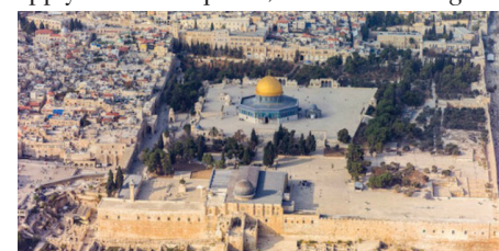
An aerial view of the Temple Mount in the Old City of Jerusalem.