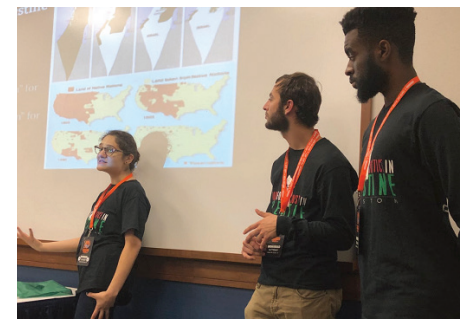
Members of Students for Justice in Palestine speak at the “Palestine Without Borders” session at the 2018 United We Dream National Congress.

“SJP is targeting the Jewish students on