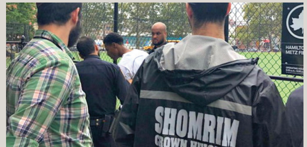
Police in Crown Heights arresting a teenager who assaulted a Jewish man with a stick.

Local news outlet Crown Heights Info reported that the incident occurred on Monday afternoon at the intersection of Empire Boulevard and Albany Avenue. The victim was accosted as he was crossing the street by a black teenager carrying a wooden stick. When the victim realized he was about to be assaulted, he attempted to flee into a dry cleaning store owned by a friend and was struck by the