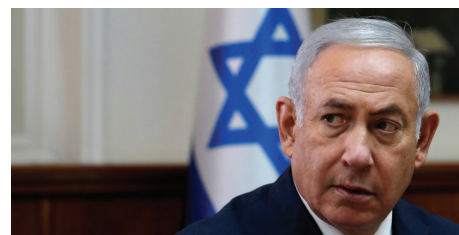
Israeli Prime Minister Benjamin Netanyahu attends the weekly cabinet meeting at the Prime Minister's office in Jerusalem September 5, 2018.

"Robbing millions of people of their political rights and holding them under military rule for generations is not a domestic issue," added the organization, "but one of international consequences and concerns."