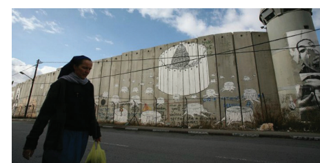
A nun hurries by the separation wall toward the checkpoint from Jerusalem on her way to the Church of Nativity in Bethlehem on December 11, 2008.