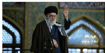
Iranian Ayatollah Ali Khamenei gestures before delivering a speech in Mashad, on March 21, 2018.