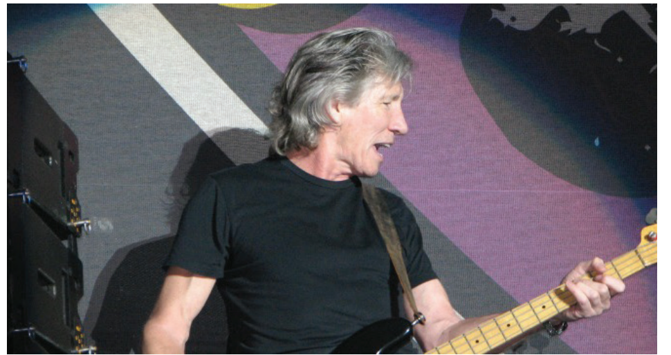
Roger Waters.