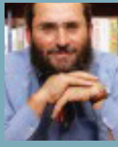
SHMULEY BOTEACH ENGELWOOD

Beginning in the early 1990's, when I began hosting Israel's then-Deputy Foreign Minister Benjamin Netanyahu at Oxford, I was blown away by his passion for his Jewishness and his unyielding pride in Israel. He launched defenses of the Jewish state before thousands of Oxford students with unsurpassed eloquence. Even as anti-Israel students chanted, "Netanyahu you should know, we support the PLO," Bibi stood proud and tall and earned standing ovations from even hostile students who were mesmerized by the force with which he championed his embattled country and persecuted people.