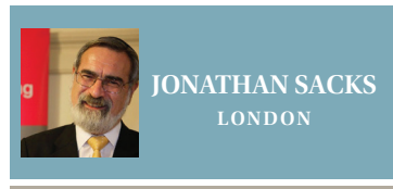
JONATHAN SACKS LONDON

The deception has taken place. Joseph has been sold into slavery. His brothers dipped his coat in blood. They bring it back to their father, saying: "Look what we have found. Do you recognise it? Is this your son's robe or not?" Jacob recognises it and replies, "It is my son's robe. A wild beast has devoured him. Joseph has been torn to pieces." We then read: