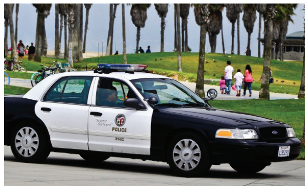
An LAPD vehicle.