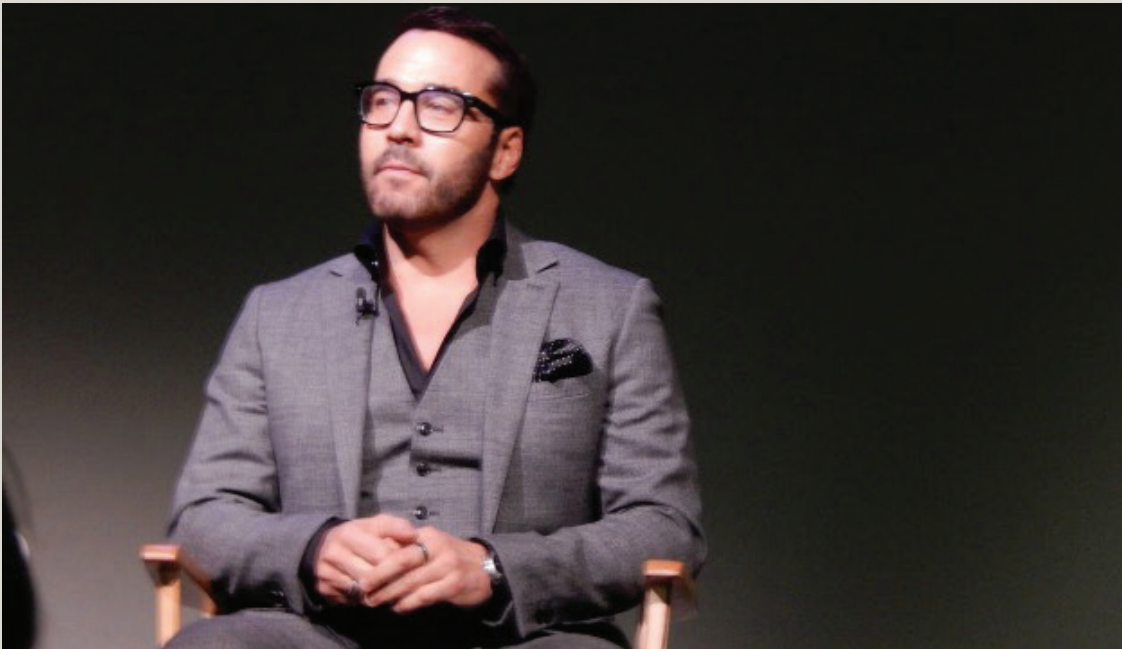
Jeremy Piven.