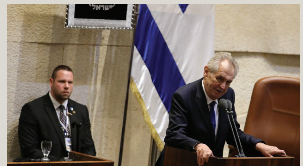
Czech President Miloš Zeman delivers a speech during a special session held in his honor at the Knesset in Jerusalem, Nov. 26, 2018.

"We Europeans... I speak about the EU, in fact, are