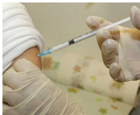
Vaccination is encouraged to prevent measles. Some 753 cases of measles have been reported to authorities in Jerusalem, with more than 1,300 cases since the beginning of 2018.

Last week, a 3-week-old baby was hospitalized in Bnei Brak after contracting the illness from his unvaccinated mother, who was infected by another family member. The baby was reported to be in stable condition.