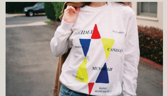
The Hanukkah shirt being sold by Haim.

The band — comprised of Jewish sisters Este, Danielle and Alana Haim — announced the sale on its Instagram page late last week, along with other holiday merchandise. The shirt is designed with a Star of David and various words associated with Hanukkah, including “Dreidel,” “Candle,” “Macca-