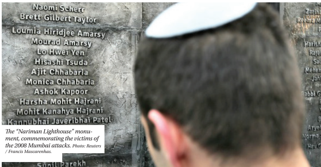
The "Nariman Lighthouse" monument, commemorating the victims of the 2008 Mumbai attacks.