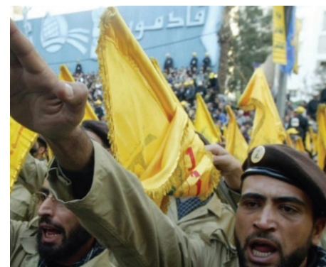
Hezbollah terrorists on parade.

It enables sanctions against not just foreign governments, per the 2015 version