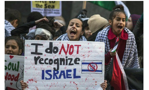
Signs at a pro-BDS protest in New York following the US decision to move its embassy in Israel to Jerusalem.

Israel's enemies haven't given up, and their hatred — rooted, as it is, in the powerful virus of antisemitism that continues to fester and grow around the world — isn't going away. It's also true that the hostility of academic elites and many in the media remain a powerful force seeking to delegitimize Zionism. Yet neither trend can erase the fact that Israel is more powerful and accepted today than it has ever been.