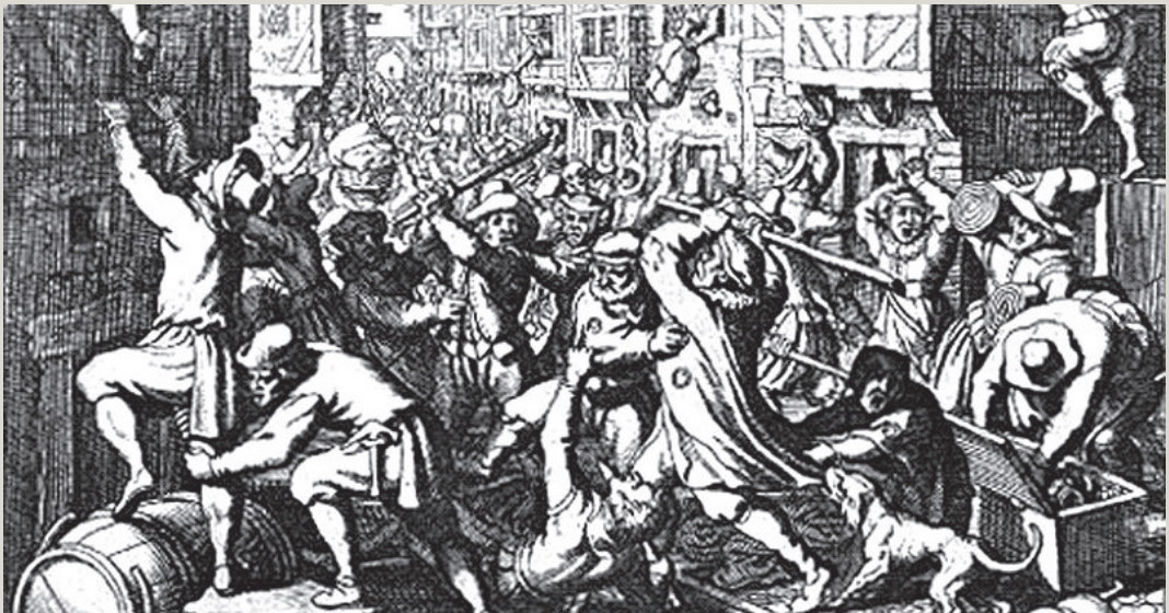
The plundering of the Judengasse during the Fettmilch riot, 22 August 1614. Engraving by Matthäus Merian in 1628.

In the US in general, the majority live in peace. Occasionally violence erupts as it always has. But more often than not, it comes from those who are mentally disturbed. The USA was born out of violence, guns, and protests. Yet most of us — white, black, Catholic, Muslim — manage to get on. That