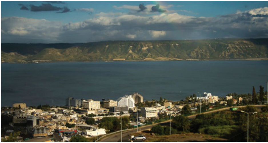
The Kinneret in Tiberias.