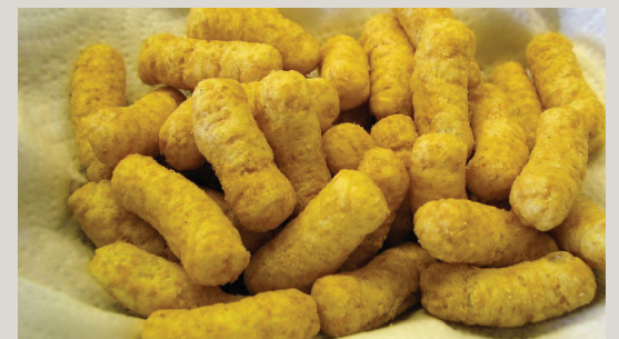
Close-up of Bamba snack, to illustrate texture, colour and shape. Bamba is an Israeli snack composed of puffed cornmeal and flavored like peanut butter. It is a Kosher food product.

Generations of Israeli kids grew up eating Bamba, first introduced in the 1960s. The popular snack is