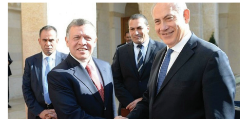
Jordan's King Abdullah (left) with Israeli Prime Minister Benjamin Netanyahu in 2014.

Under this "True State" scenario, Israel and a newly legitimate Jordan would collaborate more closely than ever on both security and economic integration of West Bank Palestinian residents in Israel's economy. Ask the West Bank Palestinians (not their corrupt "leaders") where in the Middle East — or anywhere else, for that matter — they would enjoy a better life.