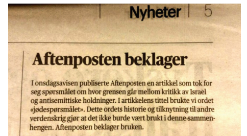
An apology in the print edition of Norwegian newspaper 'Aftenposten' over the use of the phrase 'the Jewish question.'