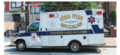
Hatzalah ambulance in Crown Heights