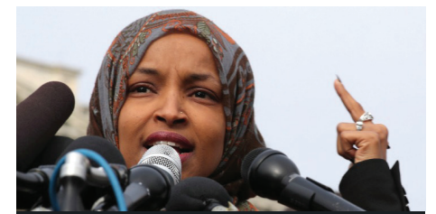
Congresswoman Ilhan Omar (D-MN) participates in a news conference at the US Capitol in Washington, DC, Feb. 7, 2019.

She also makes these claims at a time when