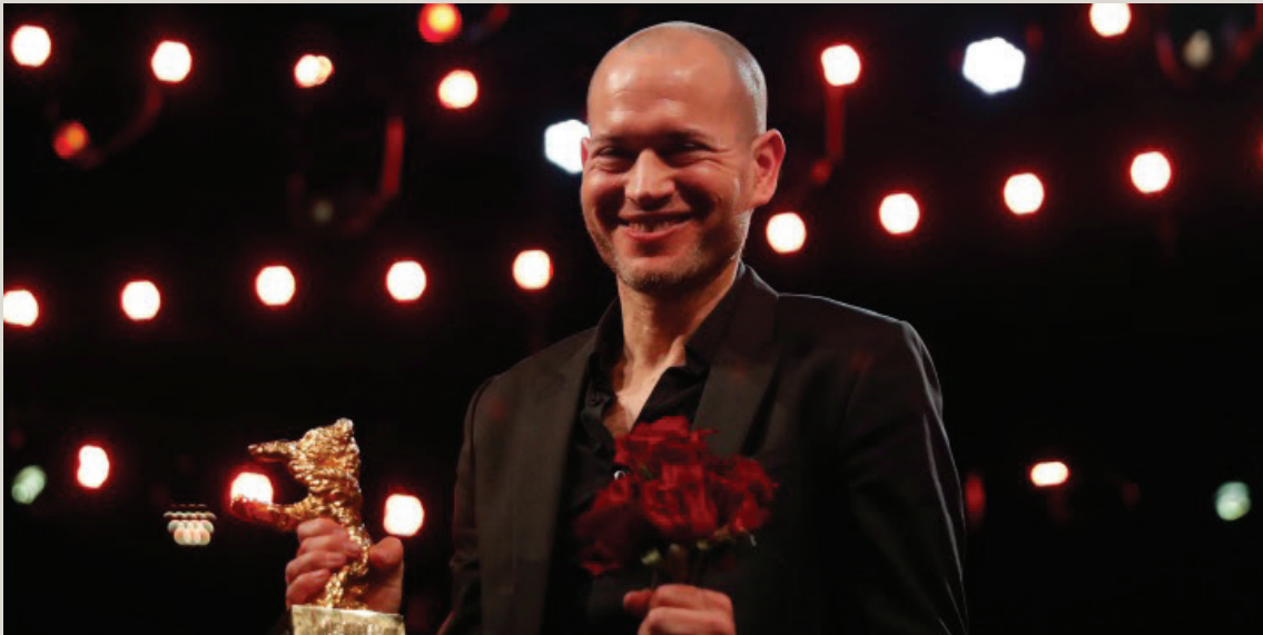
Nadav Lapid shows Golden Bear for Best Film after the awards ceremony at the 69th Berlinale International Film Festival in Berlin, Germany, February 16, 2019.