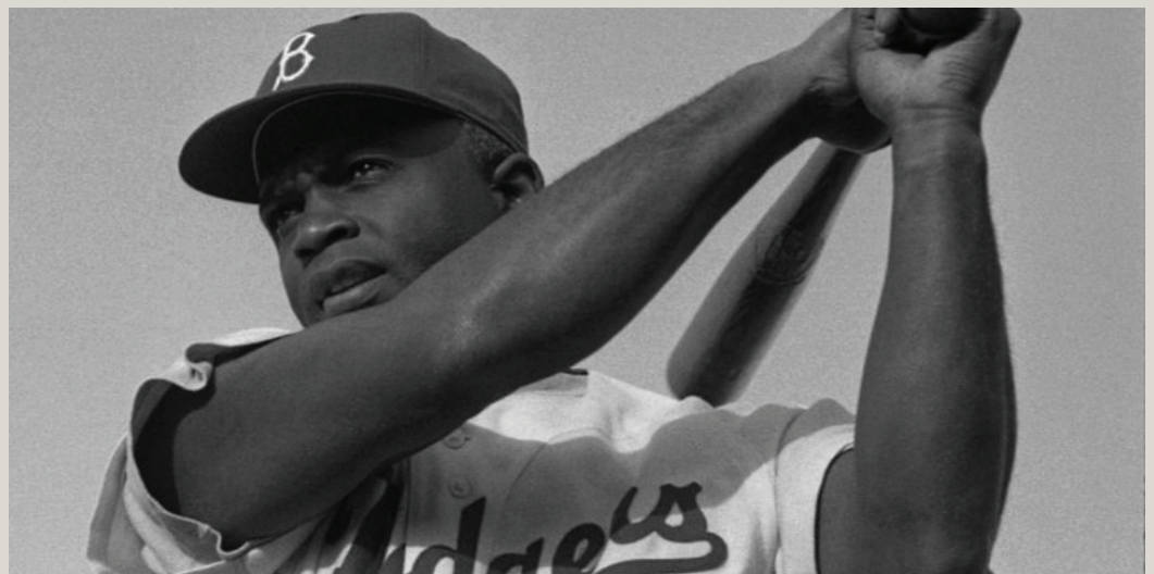
Jackie Robinson.

In May 1947, Greenberg told Robinson, “Don’t