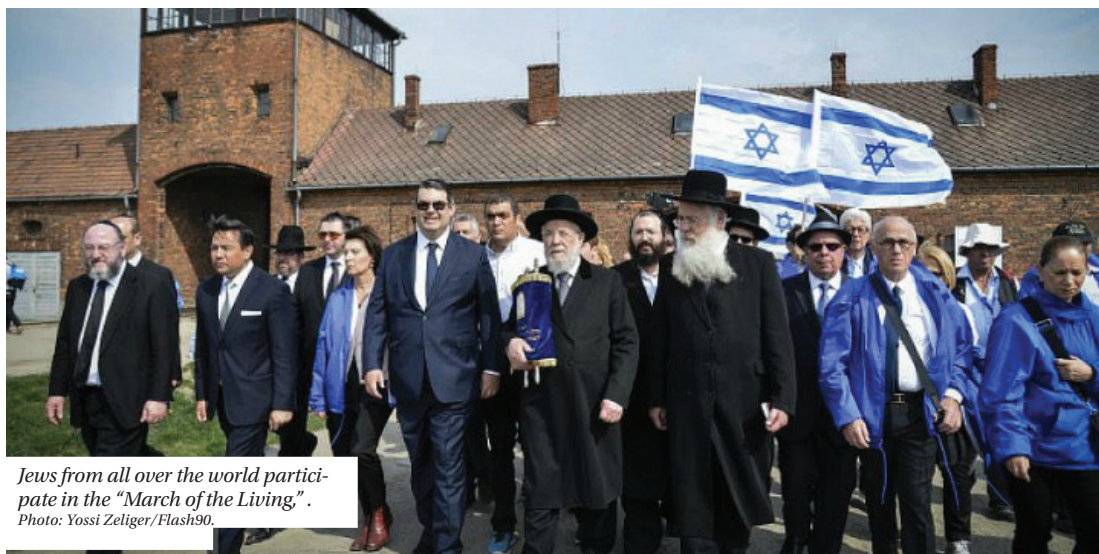
Jews from all over the world participate in the "March of the Living".