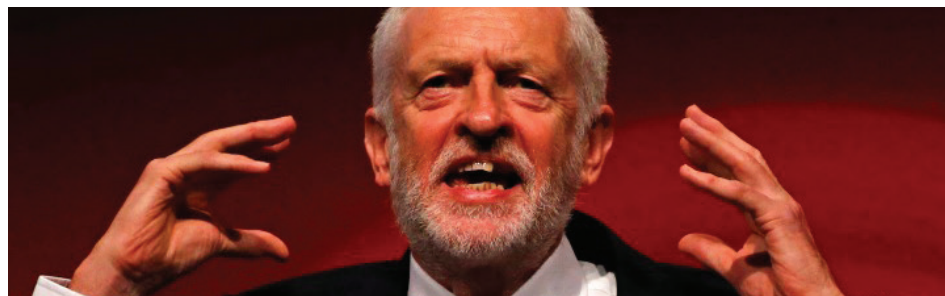
British Labour Party leader Jeremy Corbyn delivers the keynote speech at a Labour conference in Liverpool, Britain, Sept. 26, 2016.

“Countless Jewish Labour Party members have resigned in these last few years in protest at the abject failure of the Party to address a growing culture of antisemitism, obfusca-