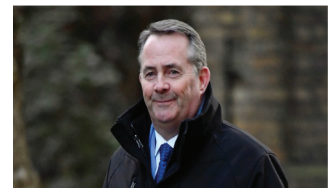
British Secretary of State for International Trade Liam Fox arrives at Downing Street in London, Jan. 22, 2019.

"Prime Minister Netanyahu emphasized the importance of increasing pressure on Iran and cooperating with the sanctions imposed by the US with the goal of bringing about a