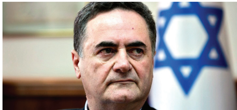
Acting Israeli Foreign Minister Israel Katz.