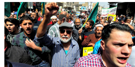
Supporters of the Muslim Brotherhood in the Jordanian capital, Amman, chanting pro-Palestinian slogans, April 2018.

Sisi, who ousted President Mohamed Morsi of the Muslim Brotherhood in 2013 and was elected president the following year, has overseen a sweeping crackdown on Islamist as well as liberal opposition in Egypt.