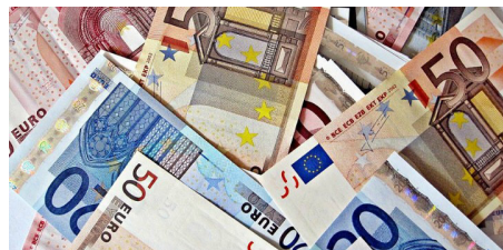
A large pile of Euro currency.