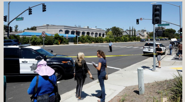
Police secure the scene of a shooting incident at the Congregation Chabad synagogue in Poway, north of San Diego, California, April 27, 2019.