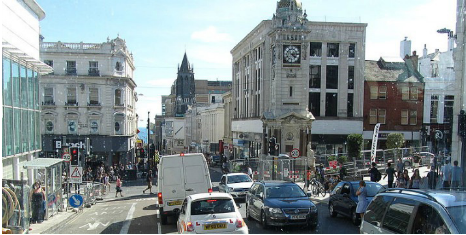
Brighton and Hove.