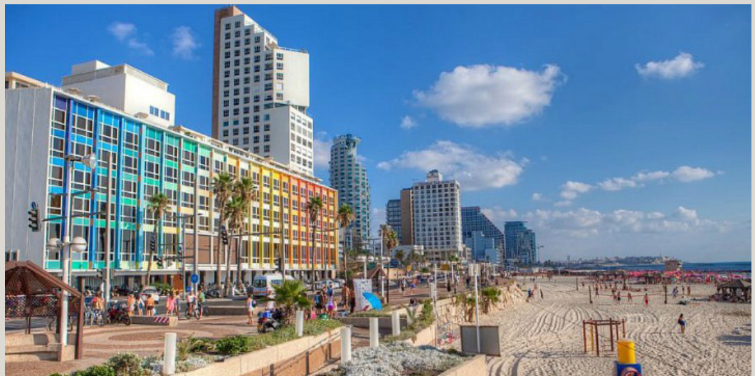
Tel Aviv.