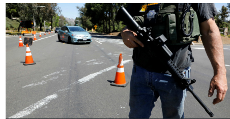
A San Diego County Sheriff’s Deputy secures the scene of a shooting incident at the Congregation Chabad synagogue in Poway, north of San Diego, California, April 27, 2019.

But as much as the need to succumb to those impulses seems irresistible, such talk will lead us nowhere. Even more to the point, the venting of this frustration and the exchange of accusations by those who have injected politics into the discussion does