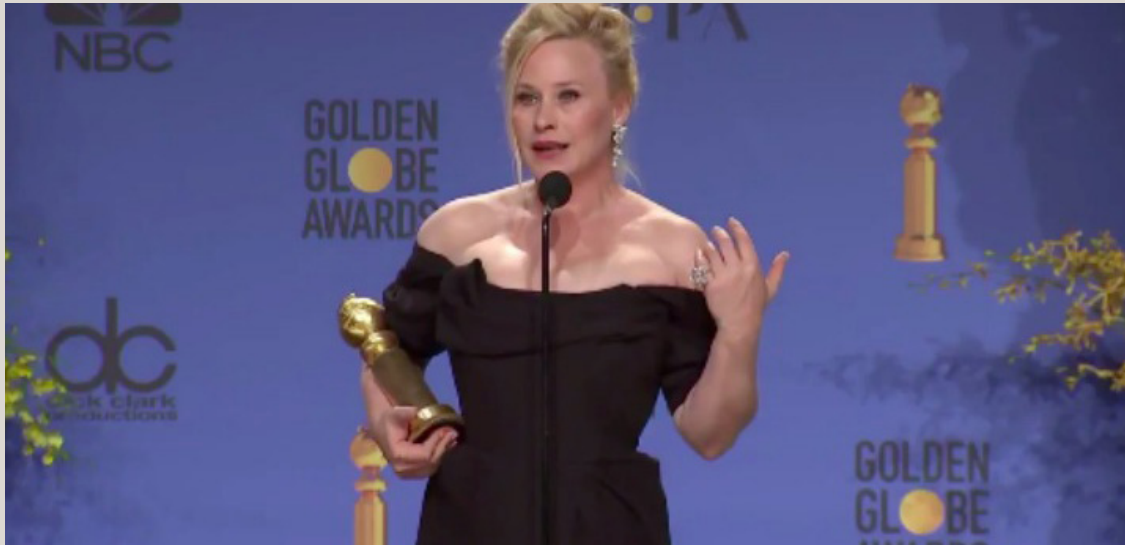
Patricia Arquette following her win for Best Performance by an Actress in a Limited Series or a Motion Picture Made for Television category for her performance in 'Escape at Dannemora,' at the 2019 Golden Globes.