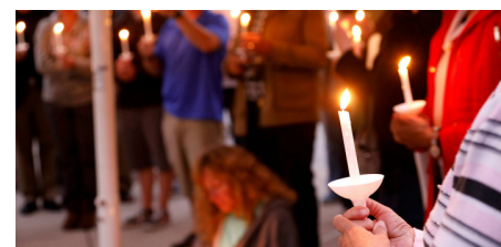
A candlelight vigil is held at Rancho Bernardo Community Presbyterian Church for victims of a shooting incident at the Congregation Chabad synagogue in Poway, north of San Diego, California, U.S. April 27, 2019.

Really? How hard? In our polarized country, divided by so many grievances, with smoldering anger everywhere, hatred may be the one believable, reliable truth. Since the shooter was acting alone, the president mercifully withheld the "very fine people on both