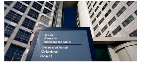
The International Criminal Court at the Hague.

It is surely more than mere coincidence that the name Judah comes from the same