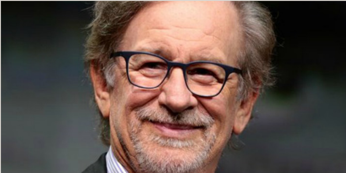
Steven Spielberg.