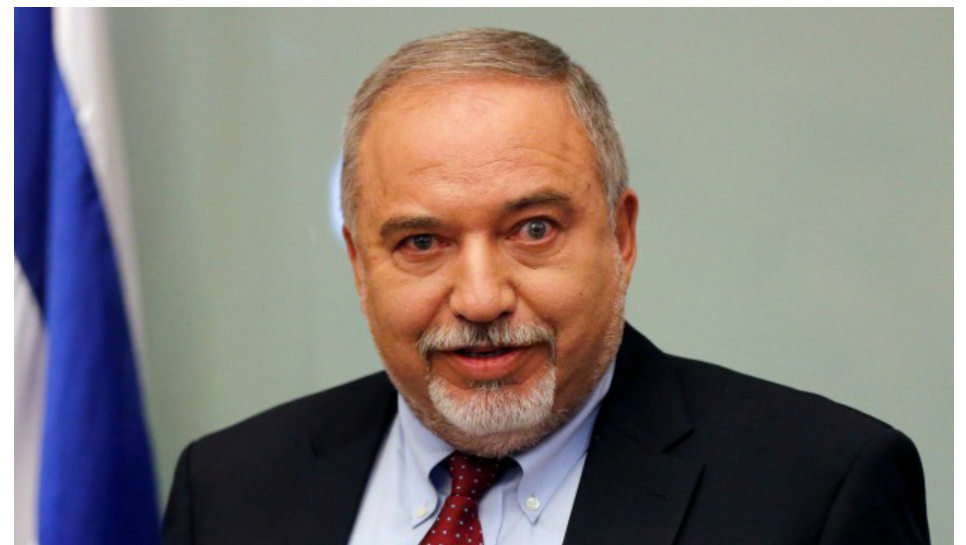
Avigdor Lieberman delivers a statement to the media at the Knesset in Jerusalem, Nov. 14, 2018.