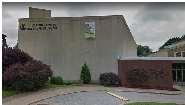
The Tree of Life*Or L'Simcha Synagogue in Pittsburgh, where a mass shooting took place during Shabbat services on Oct. 27, 2018.

It remains the deadliest attack in U.S. Jewish history, though six months to the day, a similar incident occurred on April 27 at Chabad of Poway, Calif., where a 60-year-old woman was shot dead in the synagogue lobby, also while Shabbat-morning services were taking place.