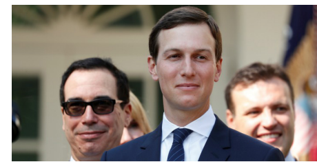
White House senior adviser Jared Kushner (C) and Treasury Secretary Steven Mnuchin (L) wait in the Rose Garden prior to President Donald Trump's news conference on the United States-Mexico-Canada Agreement (USMCA) at the White House in Washington, DC, Oct. 1, 2018.

The incident led to US Treasury sanctions on 17 Saudi individuals and a Senate resolu-