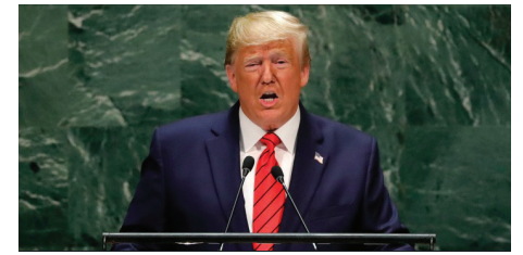
US President Donald Trump addresses the 74th session of the United Nations General Assembly, Sept. 24, 2019.

Trump made an issue of the failure of Obama's half-hearted campaign against ISIS and vowed that he would defeat the group. And that's exactly what he did after winning the 2016 election. But with ISIS largely but not completely defeated, he has now reverted to his instinctual isolationism, vowing to escape any more involvement in Syria and leaving the Kurds to their own devices after years of promises by