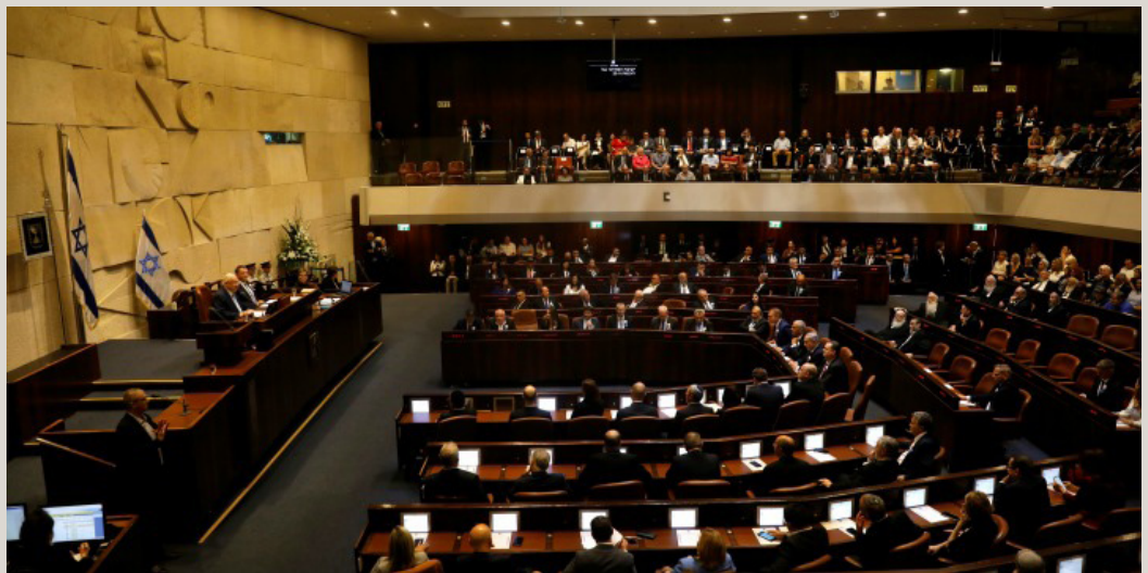
Israeli President Reuven Rivlin addresses the opening session of the 22nd Knesset, in Jerusalem Oct. 3, 2019.

While every word Bennett wrote is correct, what point is there in a leading Israeli politician insulting the American administration on social media? Prime Minister Benjamin Netanyahu, whose foreign policy experience dwarfs Bennett's, was much more careful and waited for the right