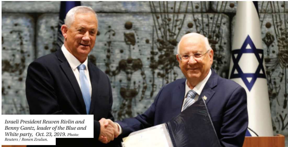
Israeli President Reuven Rivlin and Benny Gantz, leader of the Blue and White party, Oct. 23, 2019.