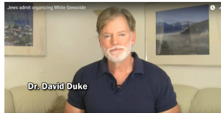
Former KKK leader David Duke narrates a YouTube video titled "Jews admit organizing White Genocide."