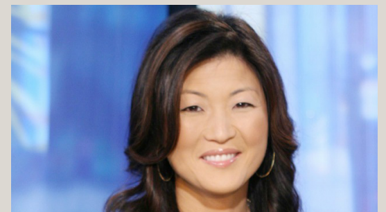
Juju Chang.