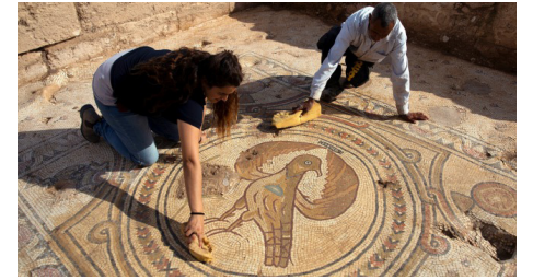
Two Israel Antiquities Authority workers clean a mosaic floor in the remains of a 1500-year-old church which archeologists say was built in honor of a 'glorious martyr,' whose identity is unknown, in Ramat Beit Shemesh, Israel, Oct. 23, 2019.

unknown, Storchan said the lavishness of the complex may indicate this person was an important figure. Another inscription showed Byzantine emperor Tiberius II Constantinus had helped fund the church's later expansion.