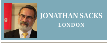
JONATHAN SACKS LONDON

In The Lonely Man of Faith , Rabbi Soloveitchik drew our attention to the fact that Bereishit contains two separate accounts of creation. The first is in Genesis 1, the second in Genesis 2-3, and they are significantly different.