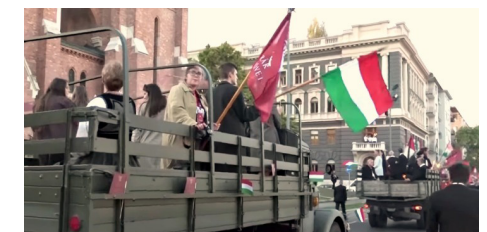
Demonstrators in Budapest marking the 1956 Hungarian uprising against Soviet rule.

On its website decorated with Nazi-style iconography, Legio Hungaria said that Wednesday's march was a "tribute to our predecessors, who fought against the oppres-