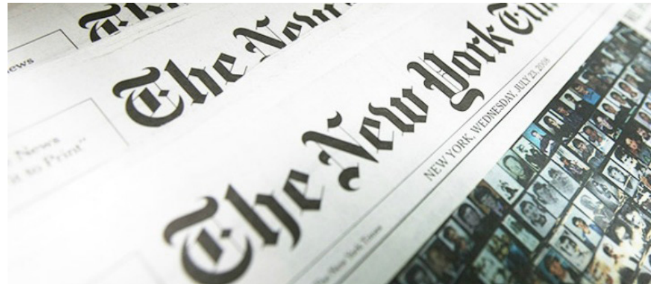
The New York Times logo.

Here is an solution for an honest and just peace: 1. Israel should return to its LEGAL 1948 borders and forbid any non-Palestinian immigration with immediate effect. 2. Pay all expenses necessary to resettle Palestinians in their historic homeland, Palestine, now occupied by Zionists and branded as Israel. 3. Use the epic fundraising apparatus which has fed the malignant growth of Judeo-fascistic Zionism to pay Palestinians compensation and punitive damages for all Zionist activity in Palestine. Existing housing and infrastructure, in as new condition, in all occupied lands and within the 1948 borders would be a partial payment. 4. Upon return of displaced Palestinians, a constitutional convention must be convened to write a constitution allowing Palestinians the right of self-determination. 5. Ratify the constitution with a plebiscite where Palestinians worldwide and Israelis living within the 1948 borders will determine the future of the currently named State of Israel. Straightforward. The United States is adept at regime change. Maybe that skill and capability