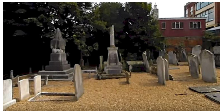
The Chatham Memorial Synagogue cemetery in Rochester, Kent, United Kingdom.

"It's frustrating that there's little chance