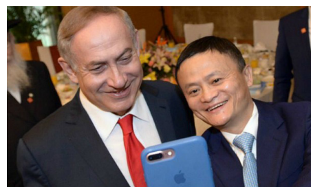
Israeli Prime Minister Benjamin Netanyahu takes a selfie with chairman of Alibaba, Jack Ma, during a meeting with leaders of large corporations in China, during Netanyahu's visit to China on March 20, 2017.

The new shipping method will be more expensive than the standard free shipping often offered through China's postal service, but significantly cheaper than other express shipping methods, the people said. Though AliExpress cannot impose the new shipping method on its mostly independent sellers, the company intends to heavily encourage sellers shipping their products to Israel to begin using it within the next few months, they added.