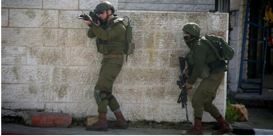
Israeli soldiers conduct a search for Palestinian terror suspects in the West Bank city of Ramallah, Dec. 10, 2018.