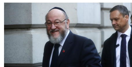
Rabbi Ephraim Mirvis, Britain's chief rabbi, arrives to attend the National Service of Remembrance, London, Nov. 10, 2019.

we should supplement the standard Israeli point that the (permissible) critique of Israeli policy can serve as a cover for the (unacceptable) antisemitism with its no less pertinent reversal: the accusation of antisemitism is often invoked to discredit a totally justified critique of Israeli politics. Where, exactly, does legitimate critique of Israeli policy become antisemitism? More and more, mere sympathy for the Palestinian resistance is condemned as antisemitic. Take the two-state solution: