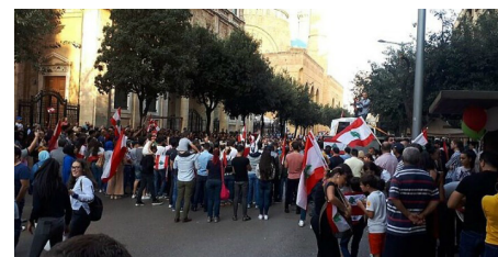
Lebanese citizens protest in Beirut on Nov. 10, 2019.

Ousted Lebanese Prime Minister Saad Hariri made a career-ending mistake when he attempted to tax WhatsApp usage as a means of compensating for the decline in usage of the national cellular companies. This attack on citizens’ connection to the world generated massive protests in Tripoli, Beirut, and