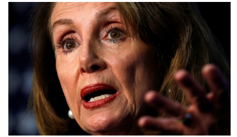
Speaker of the House Nancy Pelosi addresses guests at an event hosted by the Economic Club of Washington in Washington, US, March 8, 2019.

Pelosi spent months campaigning for Obama’s disastrous deal with Iran, in which America gave the mullahs an international facelift and $150 billion cash even as they shot protesters, hanged gays, developed intercontinental ballistic missiles, continued nuclear research and development, blackballed atomic agency inspectors, threatened a second Jewish Holocaust, and tore apart the Middle East. When the deal passed in 2015, Pelosi reportedly spent “weeks” penning “handwritten, personalized thank you notes” to every single House Democrat who backed the deal. She would tell Politico , “All I was looking for was winning.” The millions of Syrian, Lebanese, Iraqi, Yemeni, Palestinian, and Israeli citizens being terrorized by Iranian violence surely wanted