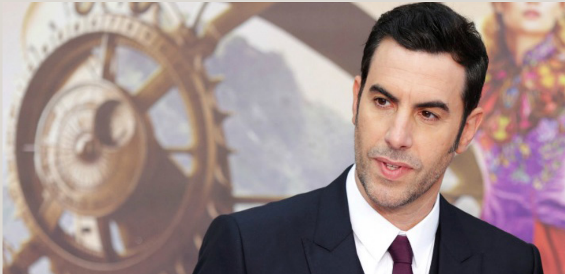
Actor Sacha Baron Cohen arrives at the European Premiere of Alice Through the Looking Glass at a cinema in London, Britain, May 10, 2016.