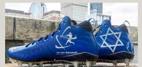
New England Patriots wide receiver Julian Edelman wore these cleats on Dec. 8, 2019 in support of baseball in Israel.

"This year my cleats will benefit the Israel Baseball Association. They do so much for the Israeli community, bringing together people of all ages through the love of the game," wrote Edelman in the post. "They also