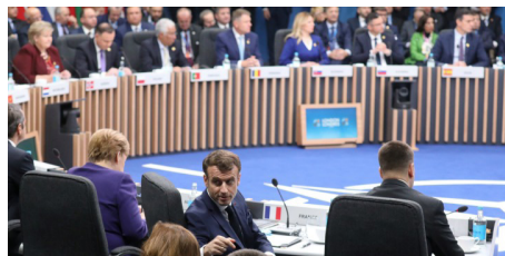
France's President Emmanuel Macron speaks to an advisor at the plenary session of the NATO summit on December 4, 2019.

Even more grave is that among all the hand-wringing, the forces that could make a difference — law-enforcement agencies, social workers, the judiciary — have signally failed to do so. Before this year is out, we