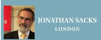
JONATHAN SACKS LONDON