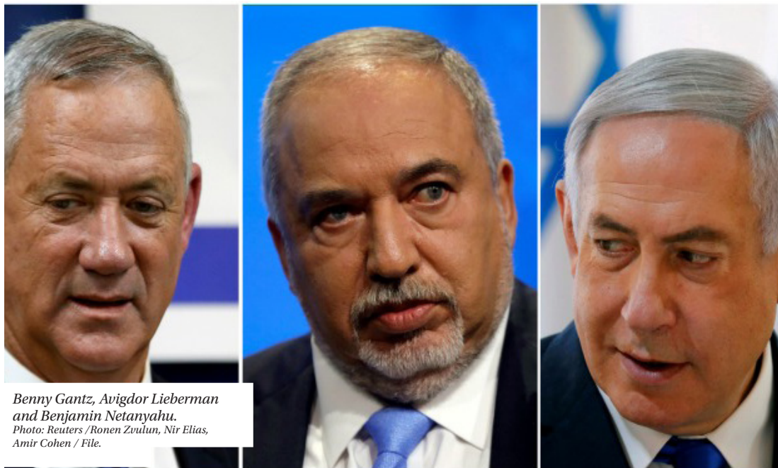
Benny Gantz, Avigdor Lieberman and Benjamin Netanyahu.