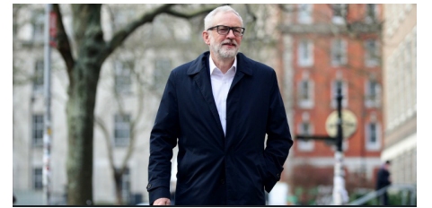
Britain's opposition Labour Party leader Jeremy Corbyn, Dec. 3, 2019.

In 2012, Corbyn attended a conference in Qatar that included two Palestinian militants that had been recently released by Israel in exchange for a captured soldier: Abdul Aziz Umar, convicted in Israel for his role in a 2003 suicide bombing in Jerusalem, in which seven people were killed; and Husam Badran, a former head of Hamas' military operations who planned suicide bombings that killed more than 100 people. Corbyn found their contributions at the conference "fascinating