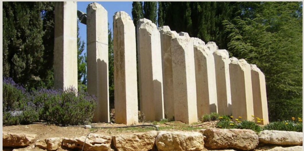
Memorial to Jewish children murdered by the Nazis, at Yad Vashem in Jerusalem, April 11, 2011.

How has this become our reality, the world we