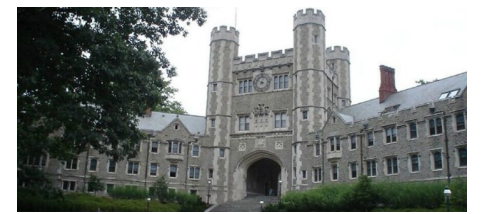
Princeton University in New Jersey.

"I'm sure many of the hard-left elements