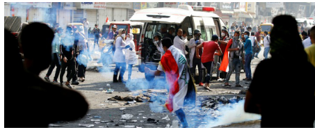
Demonstrators run from tear gas thrown by Iraqi security forces in Baghdad, Nov. 12, 2019.

"The ayatollah's quest for dominance in the Middle East has resulted in protests from Beirut to Baghdad, as well as widespread demonstrations by the Iranian people who reject the